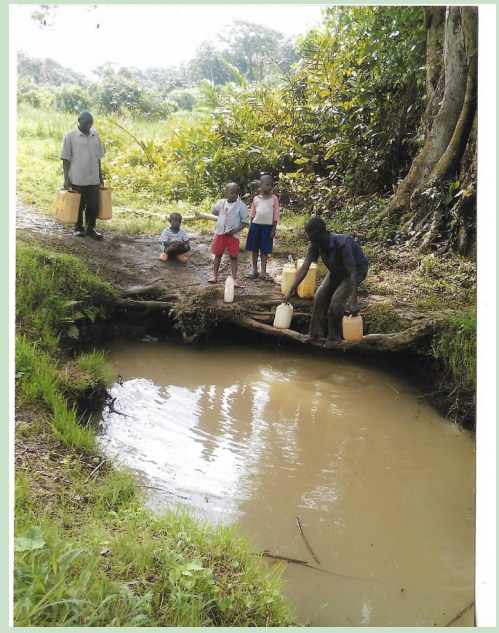
Spring before protection