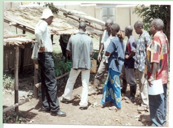
Training residents of Nangabo in nursery establishment and maintenance