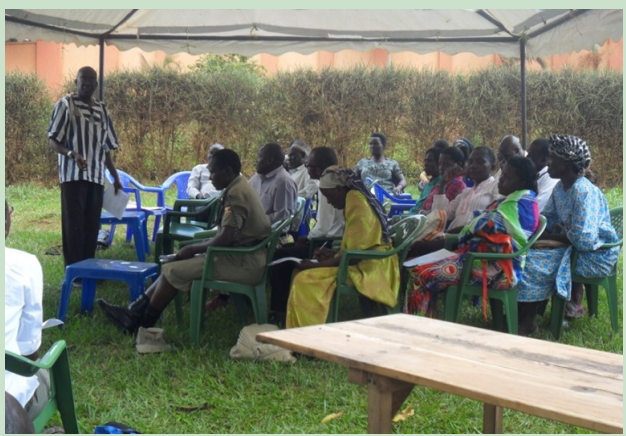
Training WASH user committees at NECEA Headquarters