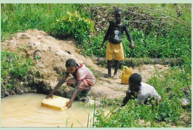
Namulondo spring, Bamba before protection

(i) PROTECTING /IMPROVING COMMUNITY WATER SOURCES