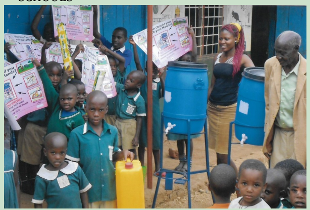
Hygiene campaign at Gitta Primary School, Kitagobwa

III) ENGAGING IN VIABLE PROJECTS SUCH AS VEGETABLE GROWING & COMMERCIAL TREE PLANT-