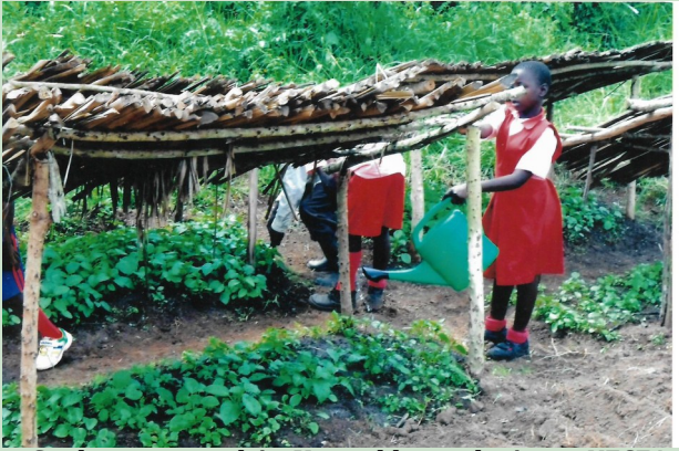
Students engaged in Vegetable gardening at NECEA headquarter

III) ENGAGING IN VIABLE PROJECTS SUCH AS VEGETABLE GROWING & COMMERCIAL TREE PLANT-