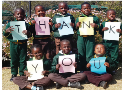
Learners at Nokuphila School, Tembisa

- Parent, Highlands Primary School, Mitchells Plain