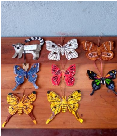
Antherina suraka moth

The back ground is natural color of silk and the moth's colors are gotten after several dyeing experiment that Sepali has started 3 years ago.