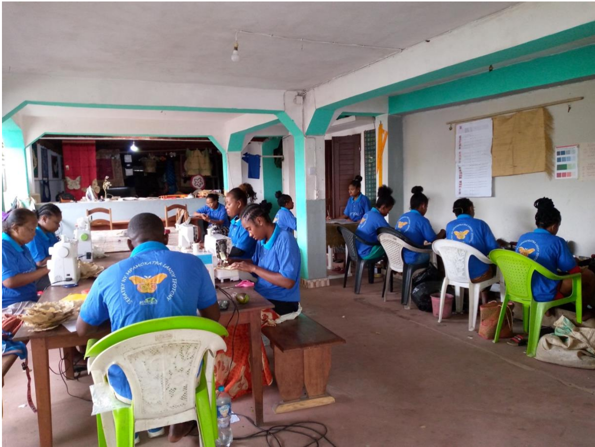
Sepali Madagascar team members, January 2023