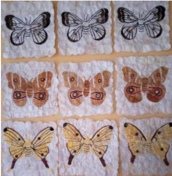
Wall decoration made up with plant dyed silk (6''x6'')

During the last three months, the Sepali Madagascar team continues its product creation following the recommendation as well as instruction that our marketing partner « Tananasilk, www.tananasilk.org » provided us.