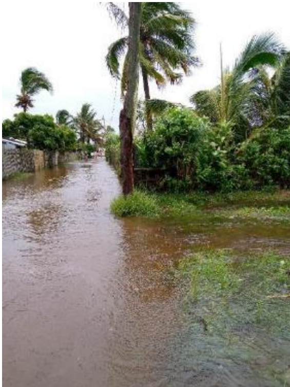
The road toward the Sepali Madagascar office in Maroantsetra (January 19th, 2023)

The team struggled to recover as fast as possible in a week that follow the hurricane damage. The town of Maroantsetra especially the local communities where we are working are flooded and the water has prevented several families to maintain their activities.