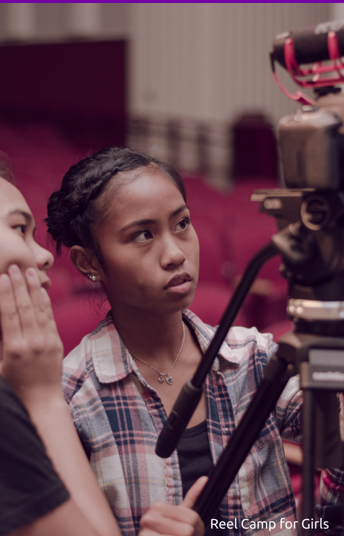
Reel Camp for Girls

We are a feminist nonprofit organization committed to achieving gender equity in filmmaking and other creative media arts. We are a creative space where film and media-makers connect, create, mentor, and inspire current and future generations of women to explore and pursue careers in the field of filmmaking.