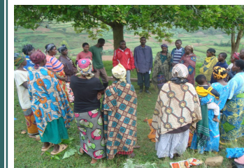
Members of Self Help Group in their weekly meeting.

Beyond Saving and access to loans, members share different social and political issues that affect them and build trust between members. Members in the SHG share problems and perceived obstacles with each other; care and concern for one another; set goals to change aspects of their lives and their environment plan and implement activities to achieve these goals and to solve issues in their families and neighborhood.