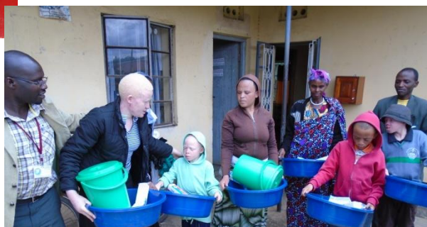
Children received hygiene & school supplies