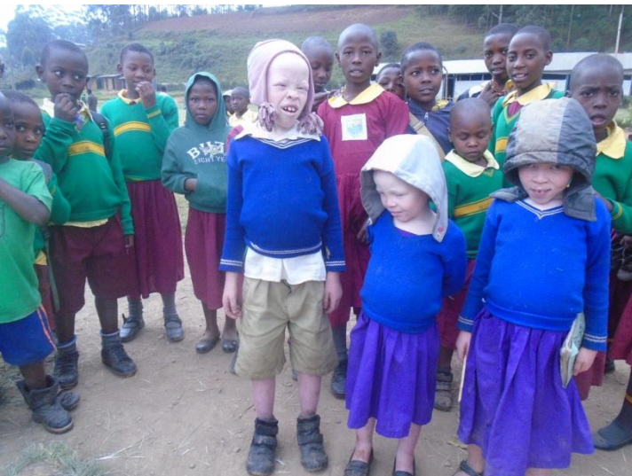
Social inclusion of albino children in schools for quality life

2 Albino children under our program have been linked and participated in trainings of HIV/AIDS Care as Community peer educators. 1 of the albinos is doing a Bachelor of Public Administration and Management and she has also worked with scosp as an interne after her computer training.