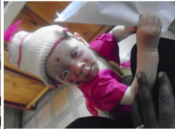
1 of the 4 baby albino children that received medical care and welfare