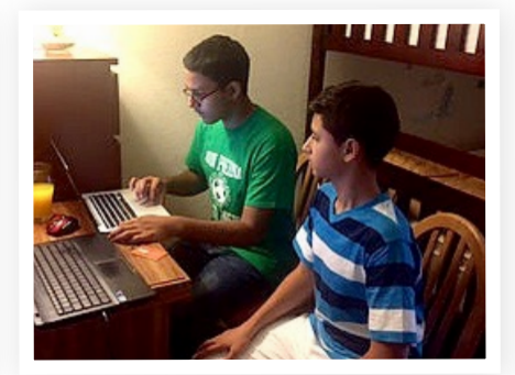
Computer and Internet tutoring is offered to help refugee teenagers communicate and connect through technology.