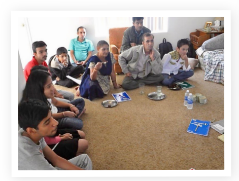
PRERNA welcomes a new refugee family to the Bay Area and gives an orientation to get them started in their new home.