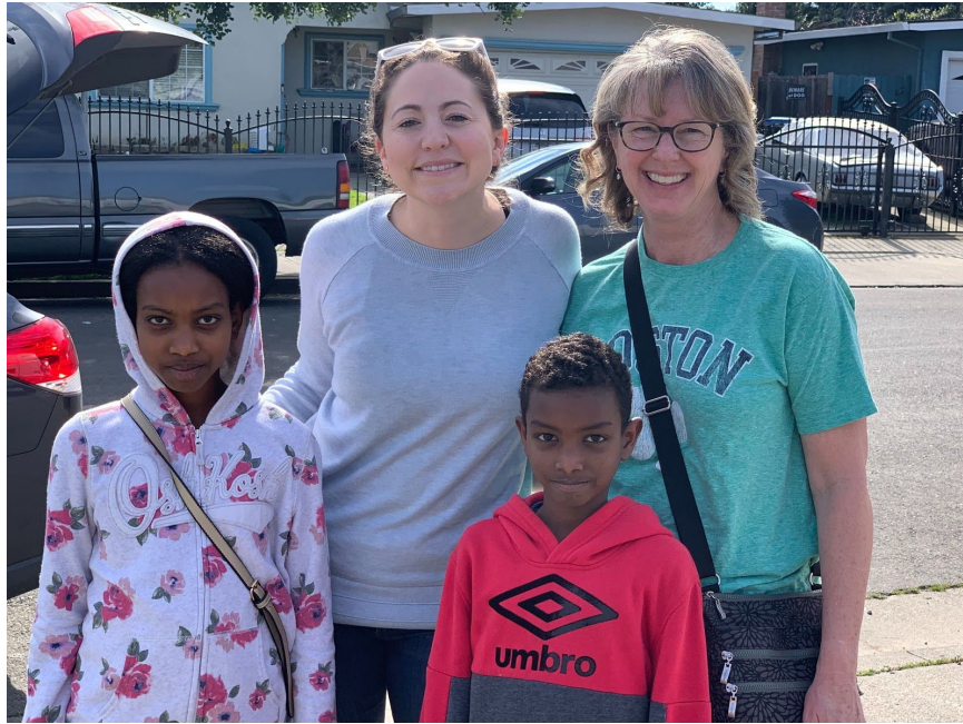
HP Community Fair in Palo Alto - March 21st. Spreading awareness about what Perna does to empower the refugees.