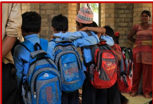
Children out of Program