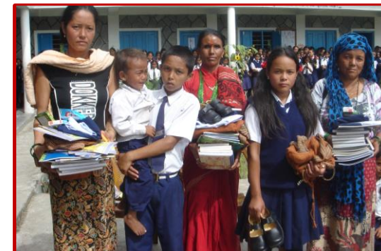
Supervision & Distribution