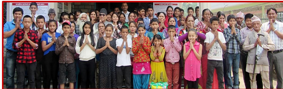
Group picture 2016 in front of NCF buliding