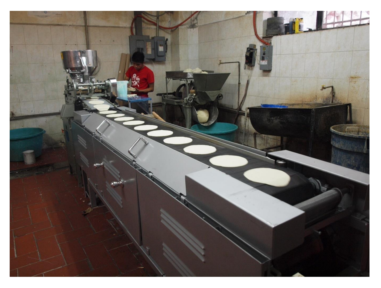
Our provitional kitchen