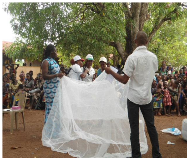
Demonstrating Use of LLITN