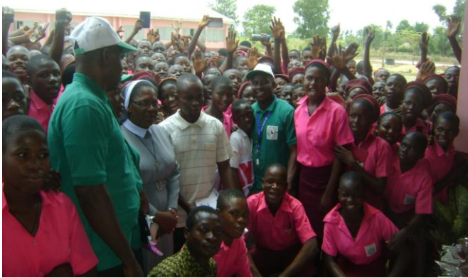
Sanitation outreach to Schools: Clean Hands Saves Lives

Outcome: ODF status, Access to clean water and good Hygiene practices in Ebonyi state