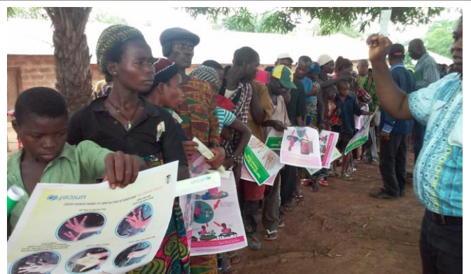
Community Outreach on Sanitation CLTS Triggering