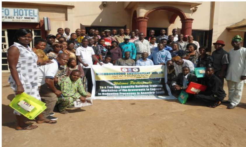
GROUP PICTURE OF PARTICIPANTS AT THE TRAINING WORKSHOP