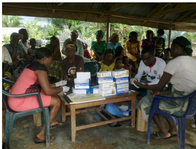
RDT diagnosis for Malaria

Outcome: BCC/ Community Awareness and practice of malaria control and prevention in 84 Communities in Ezza North, Afikpo North and Afikpo South LGAs