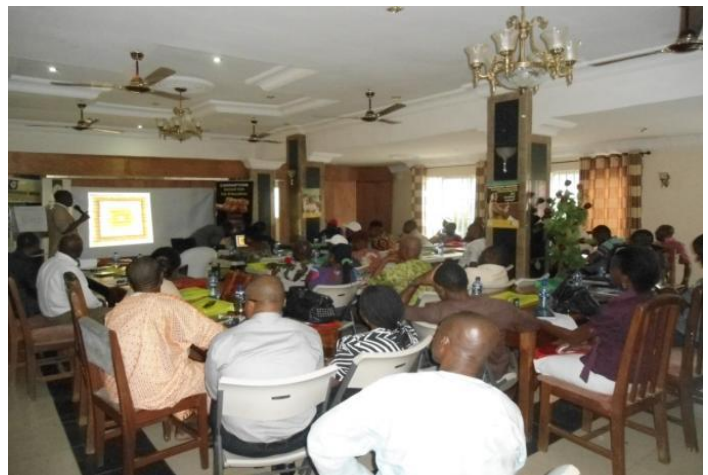
PARTICIPANTS AT A CAPACITY BUILDING WORKSHOP