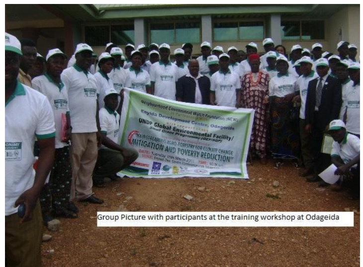
Group Picture with participants at the training workshop at Odageida

30000 tree seedlings raised and 200 farmers trained on agro-forestry practices