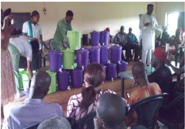
Distributes Water Filtering Buckets to communities