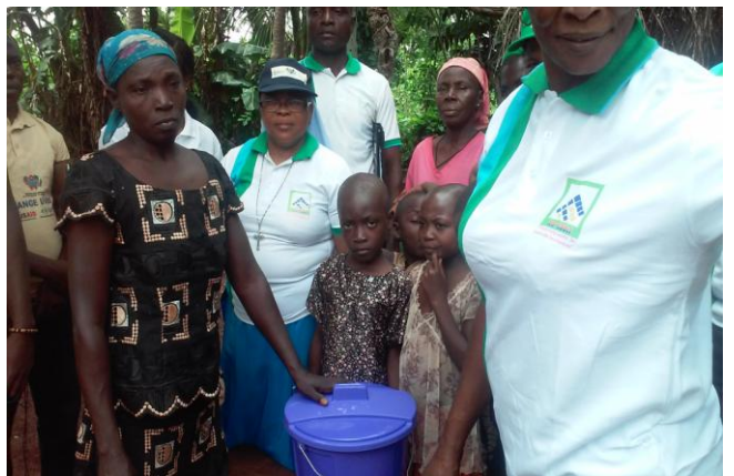
Providing water filtering Buckets to community members

Project Title: Comprehensive HIV Prevention and Behavioural Change Intervention for OSYs, TWs, PIs, & Women in Ebonyi State (3979-01-NEW-01)