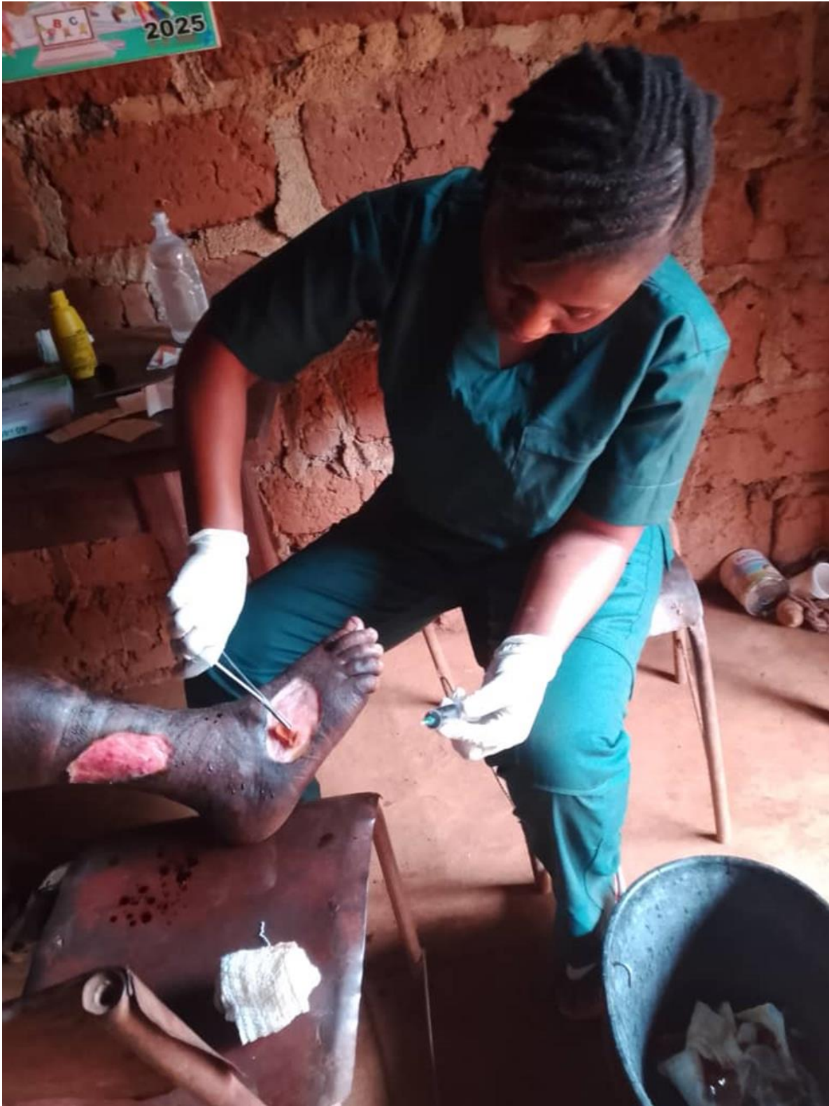
One of our female Medical workers of Our RECEADIT/ GlobalGiving Partnership, Mbam Community Health Center on her Home Visits Program, attending to a child and her mother at their home.