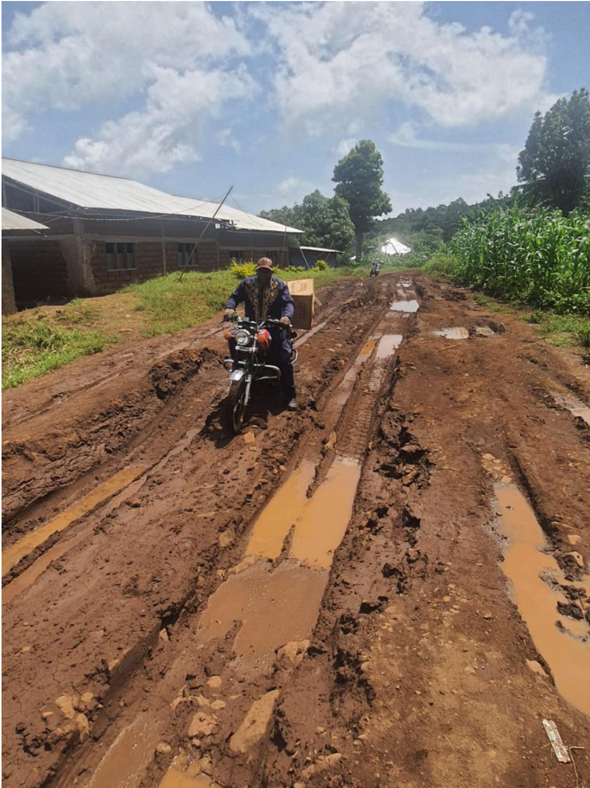
One of our bikers with his bike, loaded with medical equipment and food items at Mbam where Our RECEADIT/GlobalGiving Partnership, Mbam Community Health Center is located, getting ready to get them to some of our Internally Displaced Fellow Human Beings in the Muteff remote, rural Community.