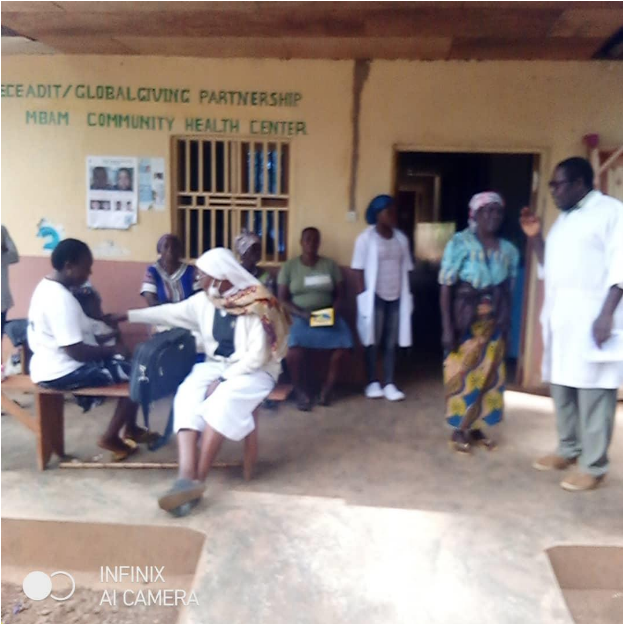
RECEADIT/Njinikom General Hospital Partnership Medical Team attending to patients at our RECEADIT/GlobalGiving Partnership, Mbam Community Health Center: Now a Monthly Scheduled, Outreach Program