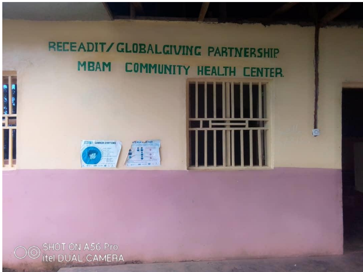
RECEADIT/GlobalGiving Partnership, Mbam Community Health Center at Mbam: The Foundation and Location of the Mbam Community Health Care Project (29930)