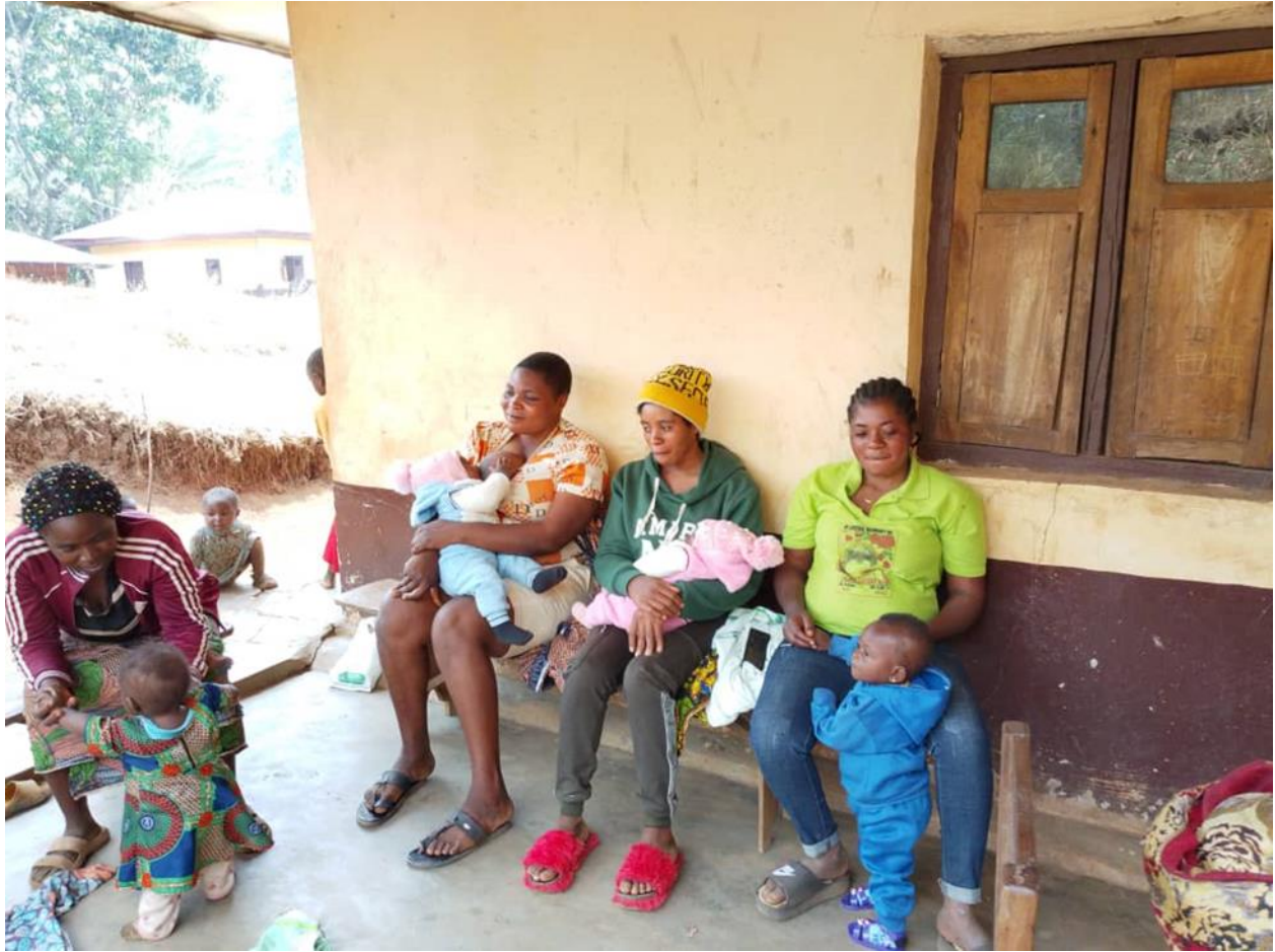
Mothers waiting for the vaccination of their children at Our RECEADIT/ GlobalGiving Partnership, Ngemsibo Community Health Center.