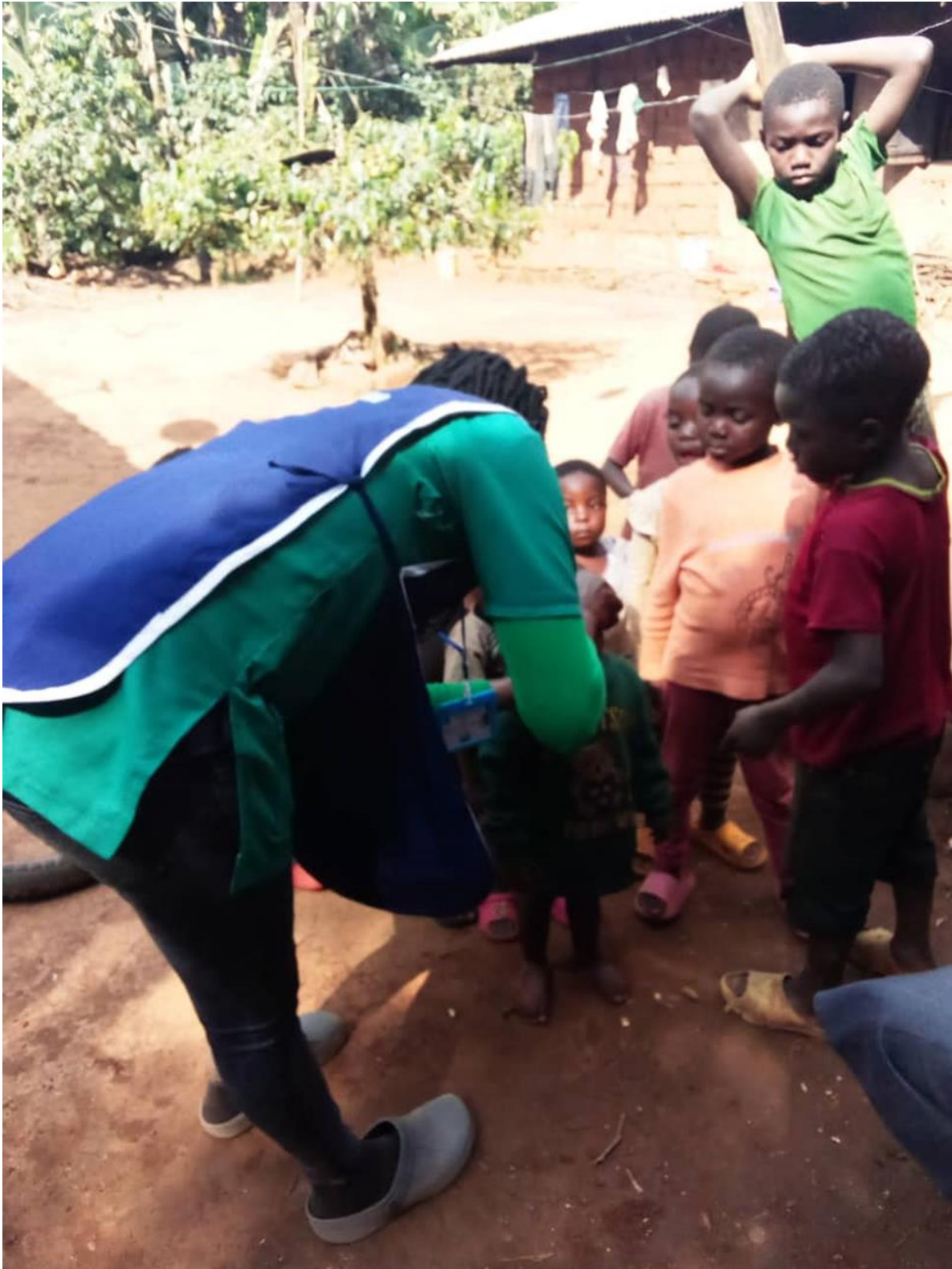
Children getting their monthly vaccination from Our RECEADIT Medical Team at Our Bassamba RECEADIT/GlobalGiving Partnership Community Health Center at the Bassamba remote, rural Community.