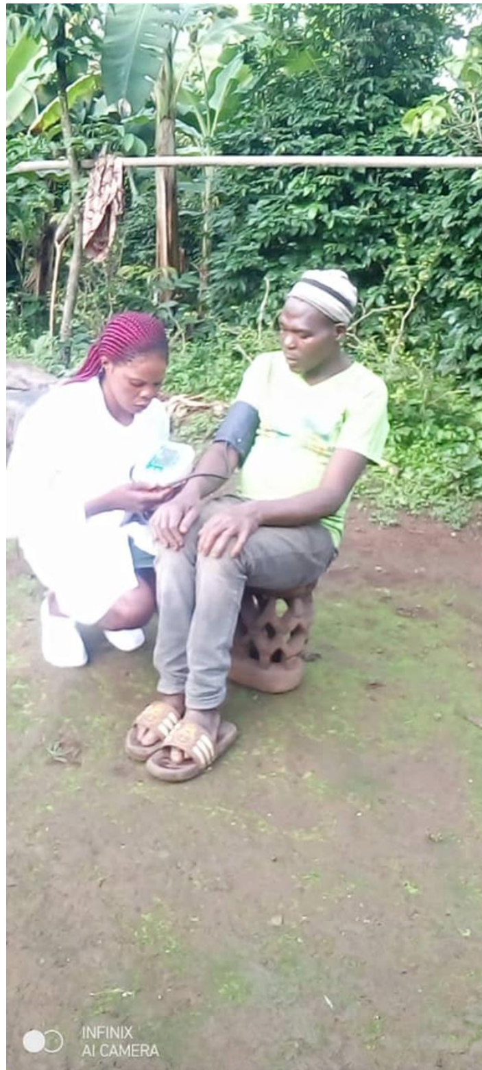
Our Determined and Committed Female nurse of our RECEADIT-Partnership Community Health Clinic at Muteff, attending to a male Patient during her Home Visits Program within the Muteff remote, rural Community.