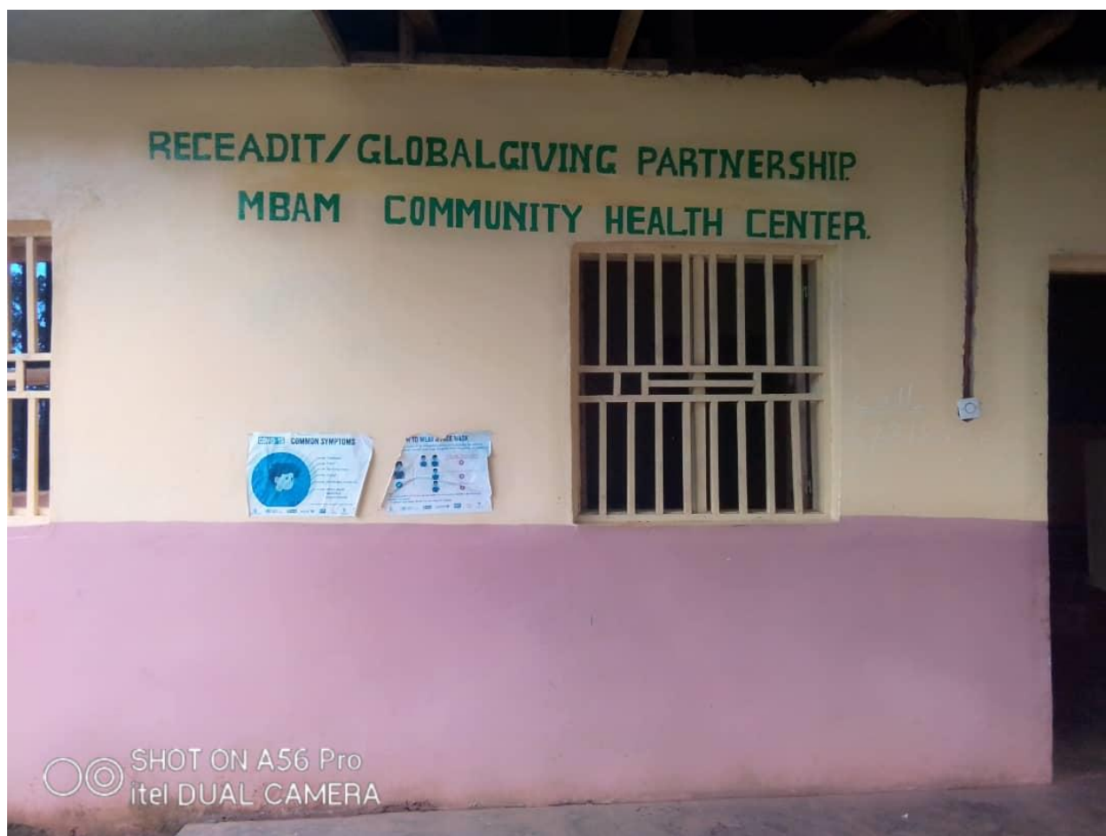
RECEADIT/GlobalGiving Partnership, Mbam Community Health Center at Mbam: The Foundation and Location of the Mbam Community Health Care Project (29930)