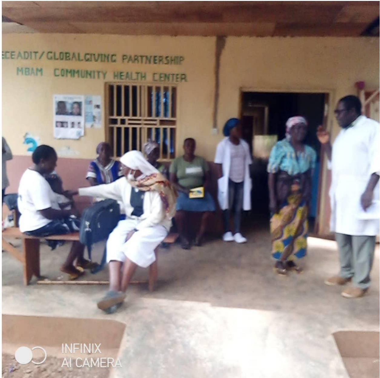
RECEADIT/Njinikom General Hospital Partnership Medical Team attending to patients at our RECEADIT/GlobalGiving Partnership, Mbam Community Health Center: Now a Monthly Scheduled, Outreach Program