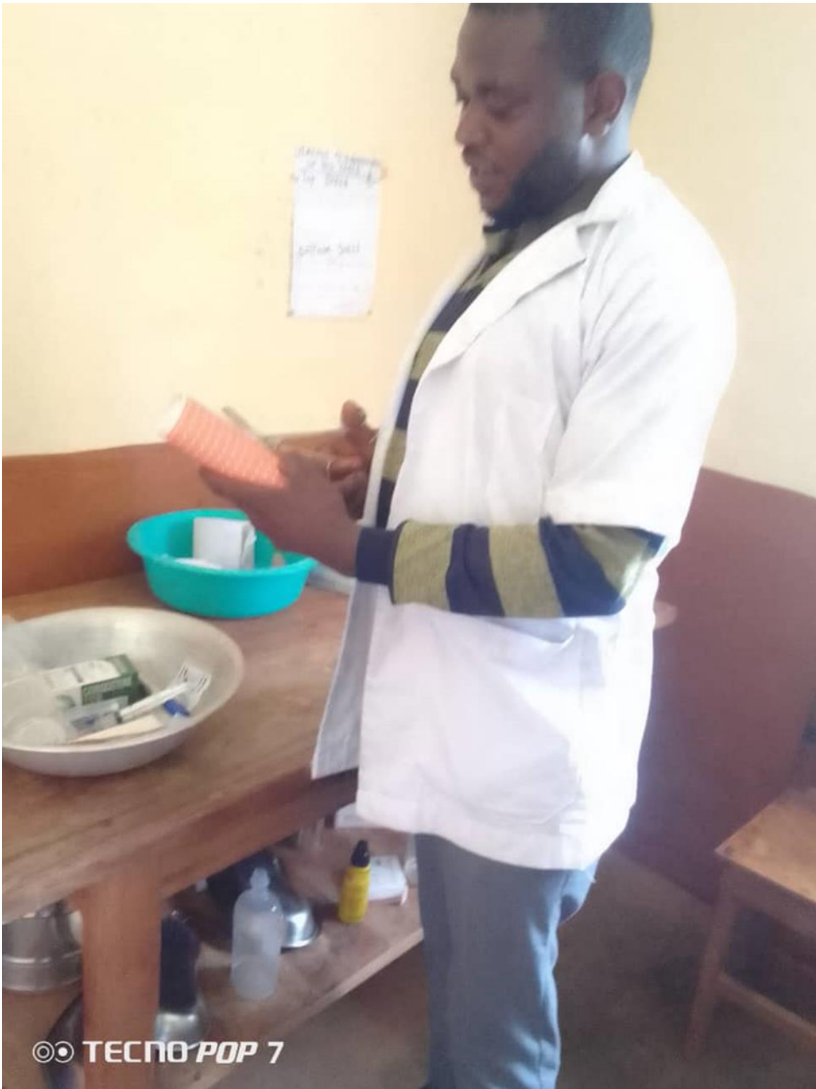
One of our Male nurses getting medication ready to attend to his female patient, who is waiting for her treatment in one of the patients' rooms at our RECEADIT/GlobalGiving Partnership, Mbam Community Health Center