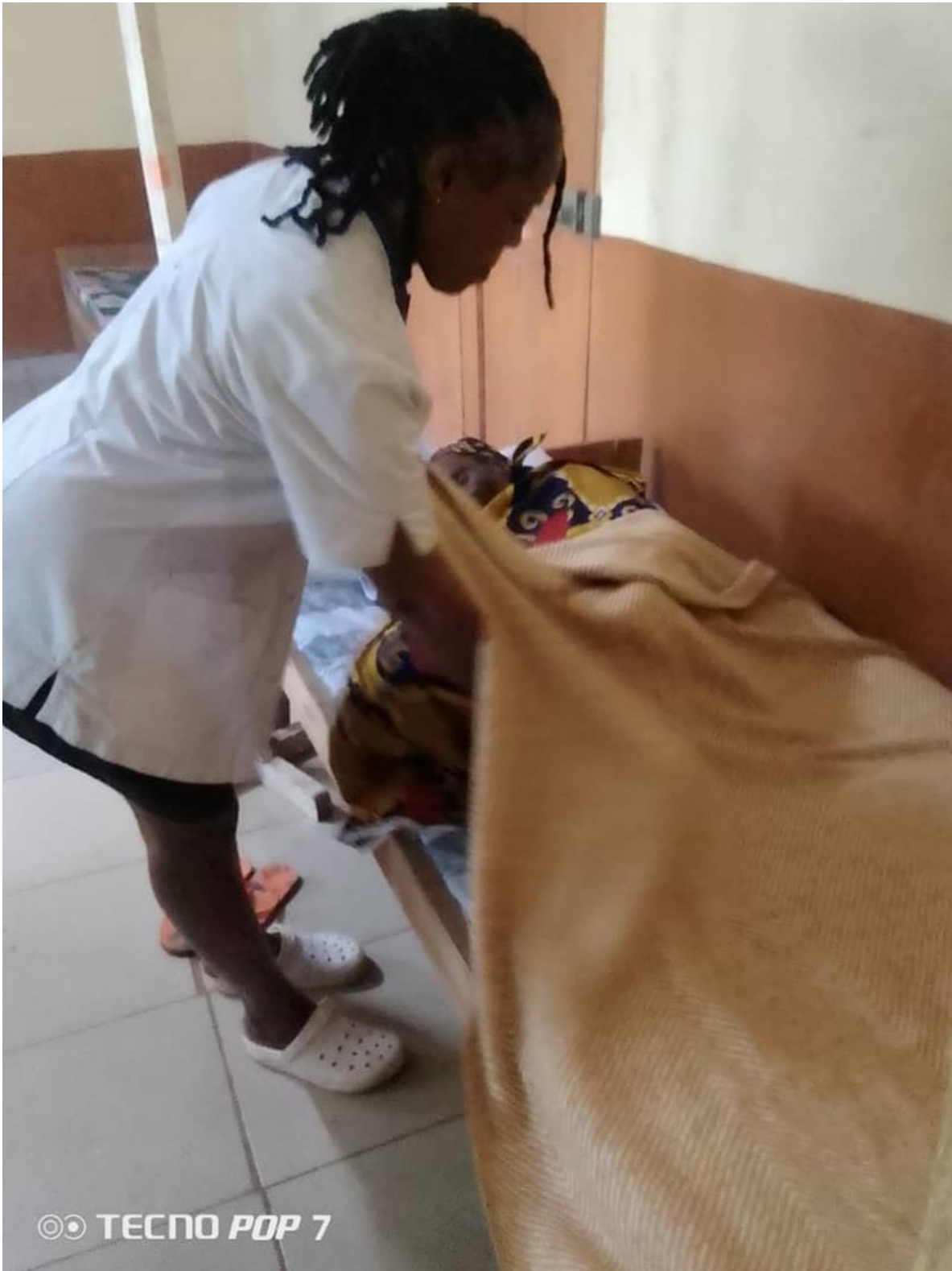
One of our Female nurses attending to child in the Children's Ward at our RECEADIT/GlobalGiving Partnership, Mbam Community Health Center