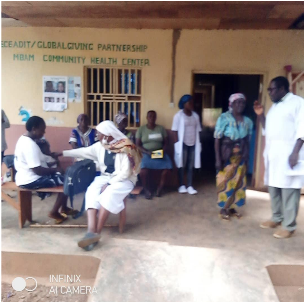
RECEADIT/Njinikom General Hospital Partnership Medical Team attending to patients at our RECEADIT/GlobalGiving Partnership, Mbam Community Health Center: Now a Monthly Scheduled, Outreach Program