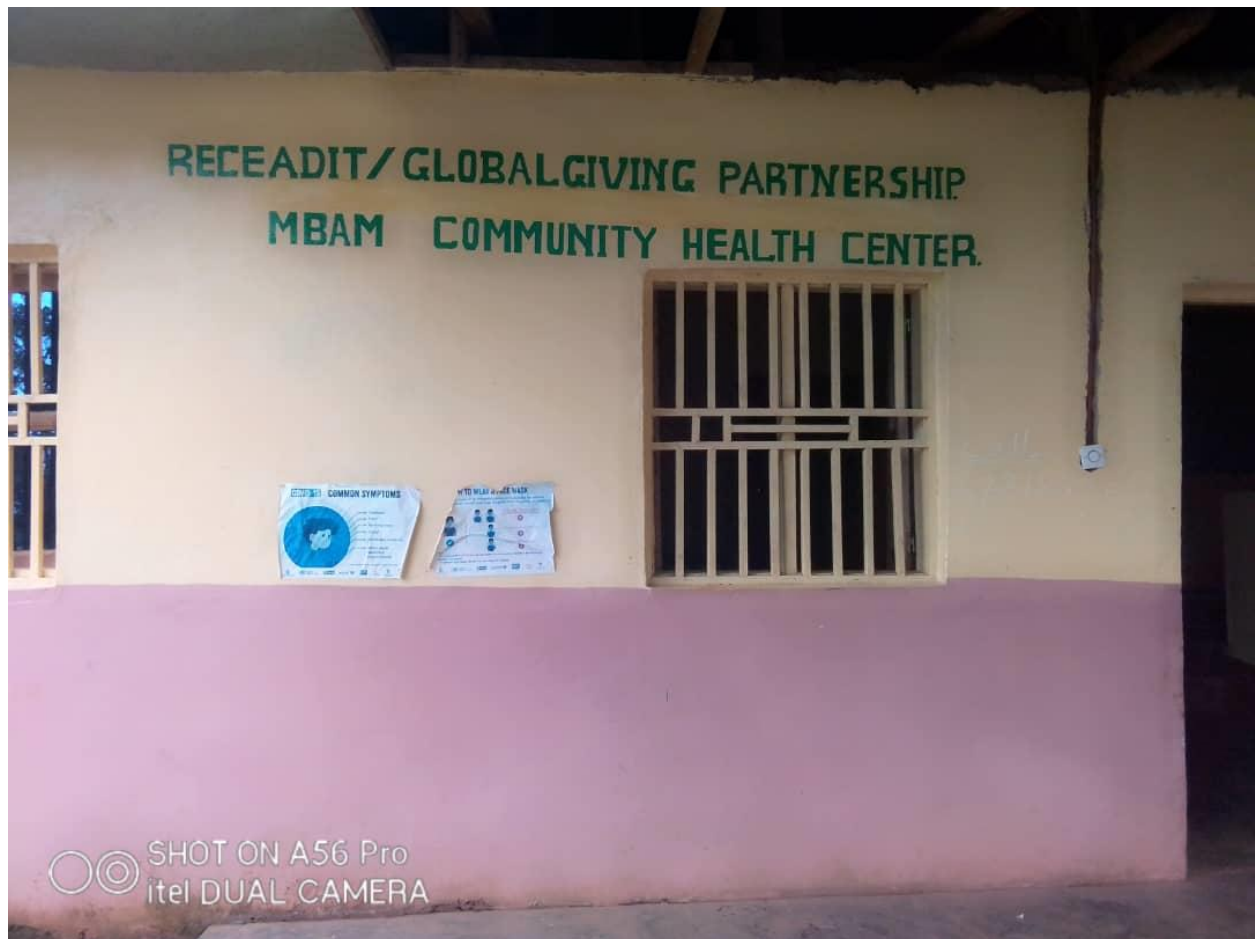
RECEADIT/GlobalGiving Partnership, Mbam Community Health Center at Mbam: The Foundation and Location of the Mbam Community Health Care Project (29930)