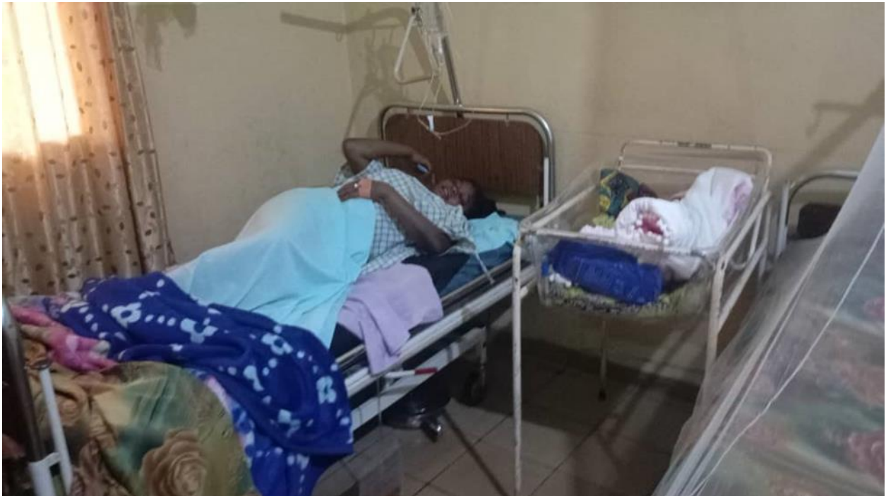
One of our female patients, who has just received treatment in one of the patients' rooms at our RECEADIT/GlobalGiving Partnership, Mbam Community Health Center