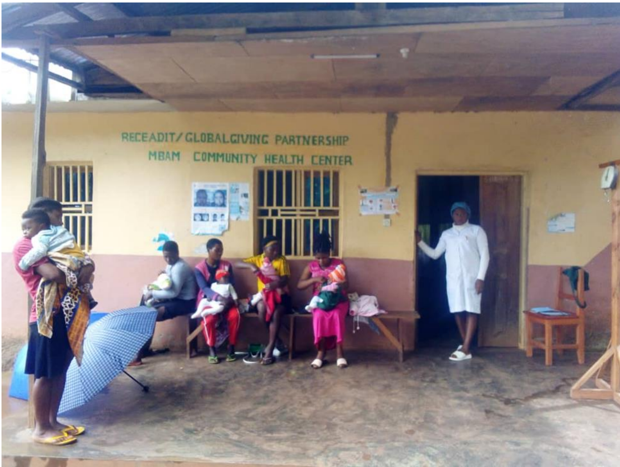
Mothers and their children waiting for our RECEADIT Medical Team to start their vaccination at our RECEADIT/GlobalGiving Partnership, Mbam Community Health Center.