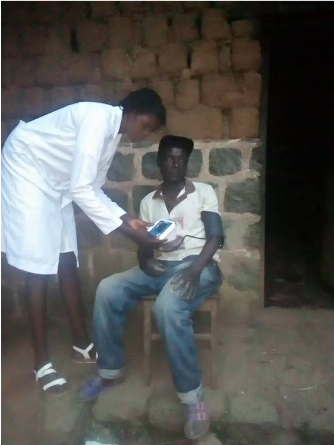
Our RECEADIT Medical Team Member of RECEADIT/GlobalGiving Partnership Community Health Center at Muteff, on her Home Visits Program, attending to a Community member at his home in the Muteff Community.