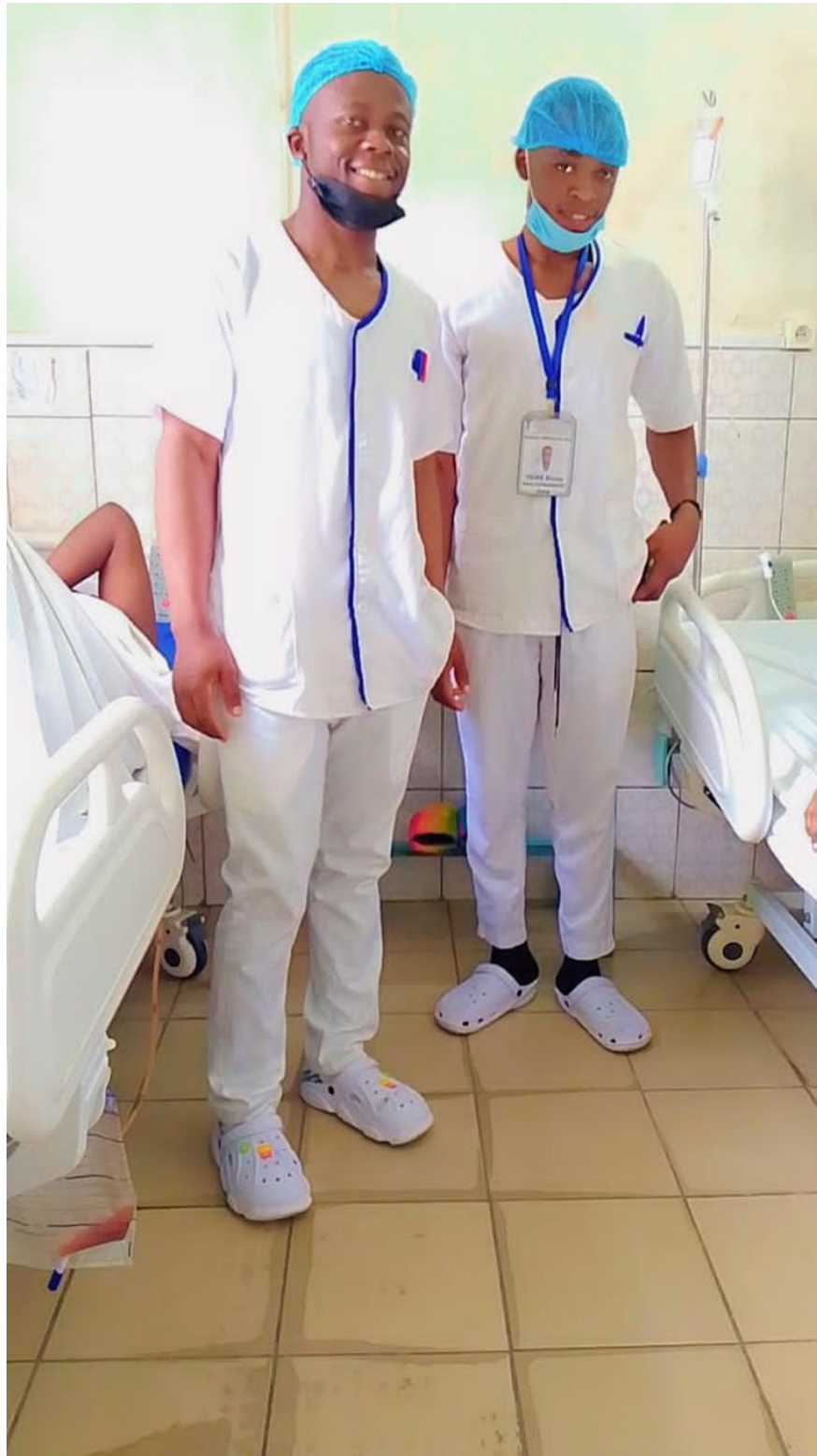
Students of Our RECEADIT Two Year Medical Training Program on their Internship at the Njinikom General Hospital, attending to patients in one of the Patients' Wards.