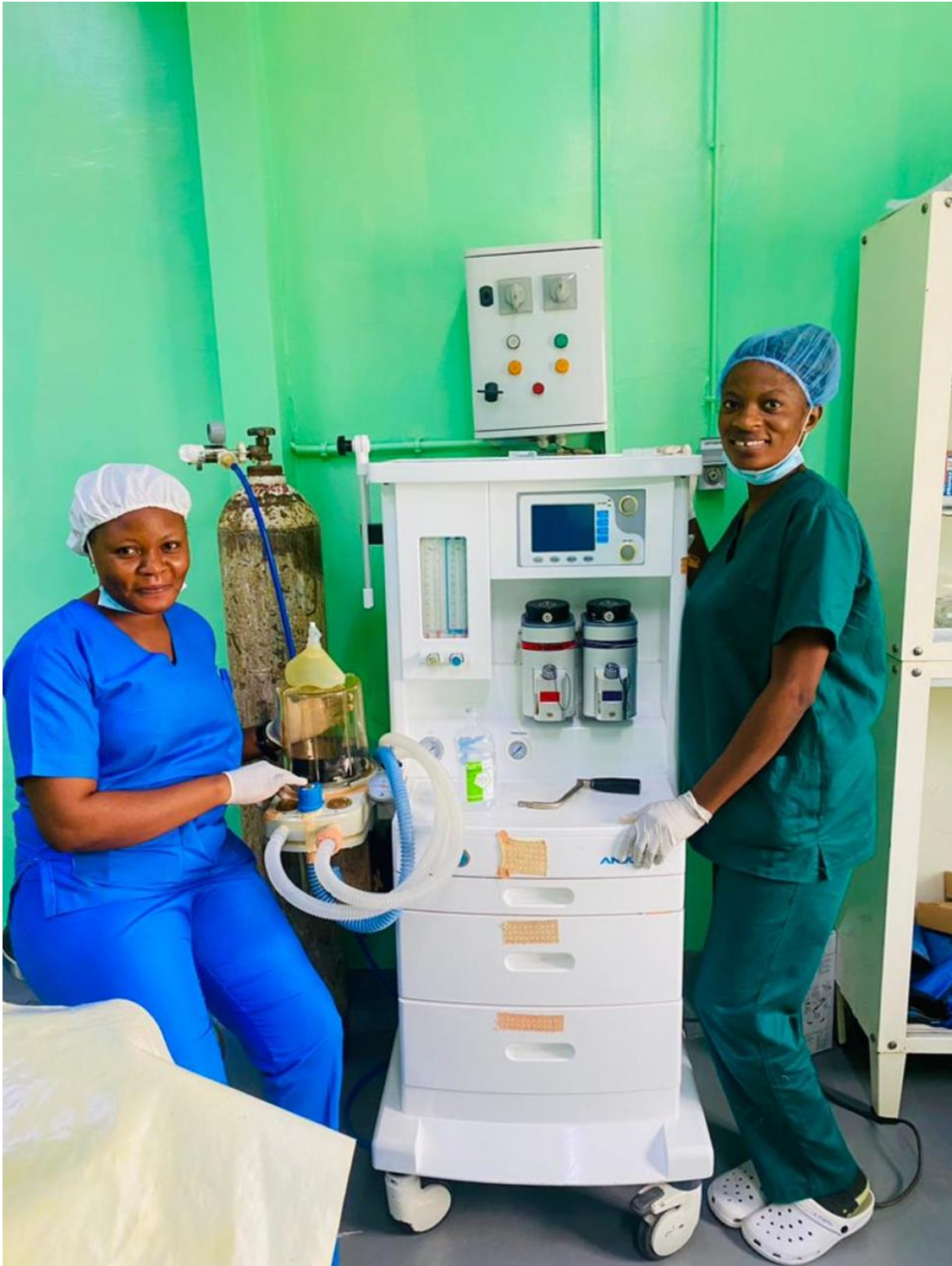
Students of Our RECEADIT Two Year Medical Training Program on their Internship at the Njinikom General Hospital, waiting for the Laboratory Technician to educate them on how this Laboratory equipment works.