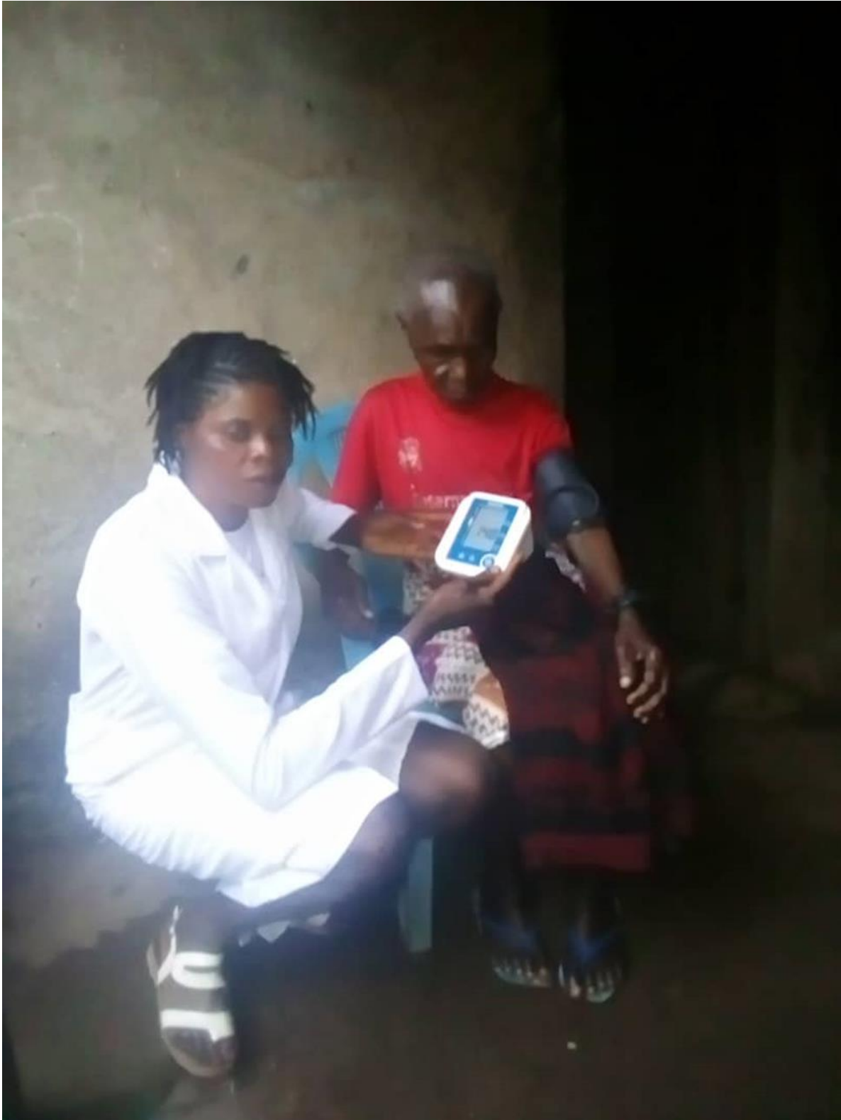
Our Determined and Committed Female nurse of our RECEADIT-Partnership Community Health Clinic at Bassamba attending to an elderly Patient within the Bassamba remote, rural Community during her Home Visits Program.