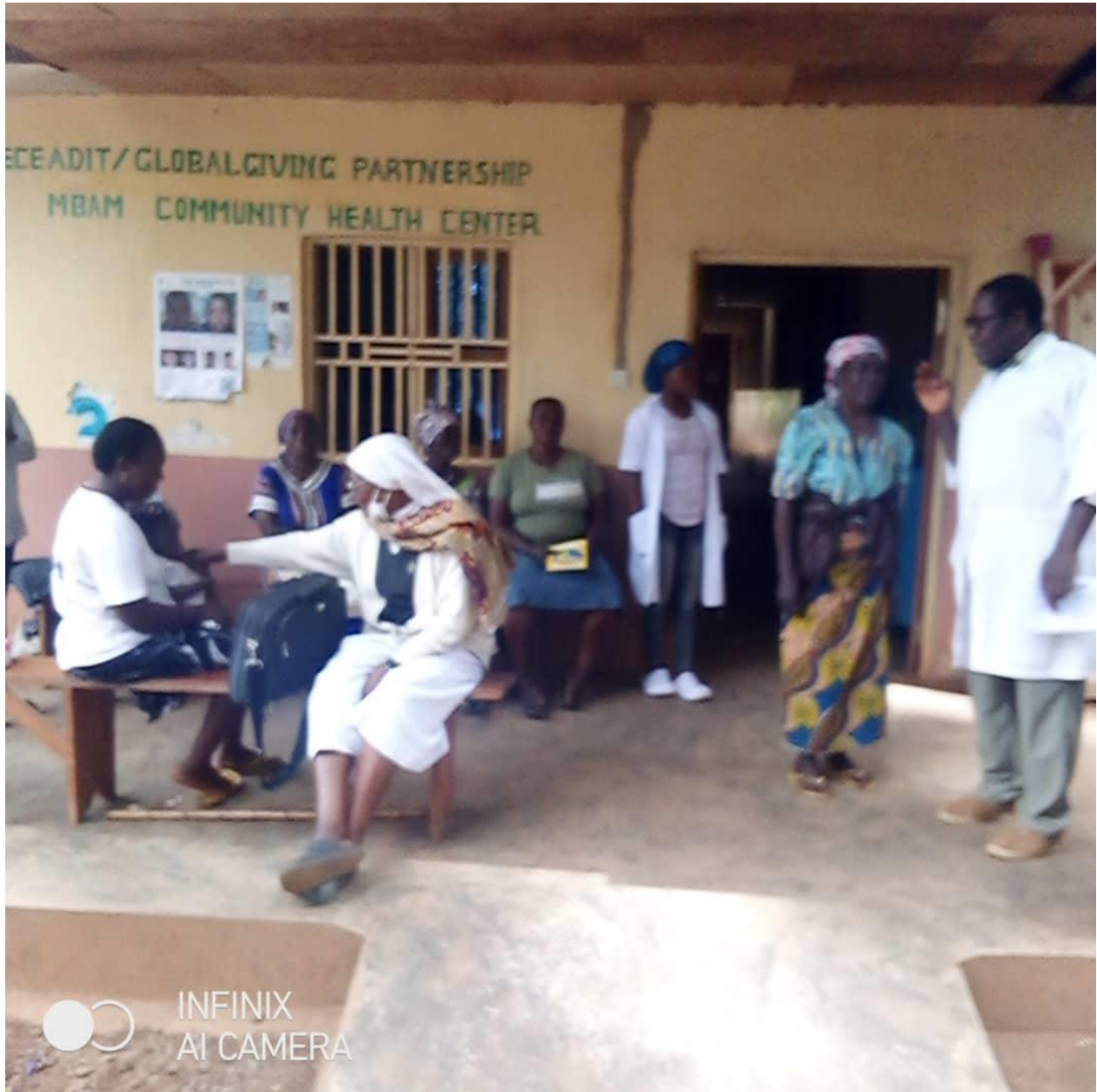
RECEADIT/Njinikom General Hospital Partnership Medical Team attending to patients at our RECEADIT/GlobalGiving Partnership, Mbam Community Health Center