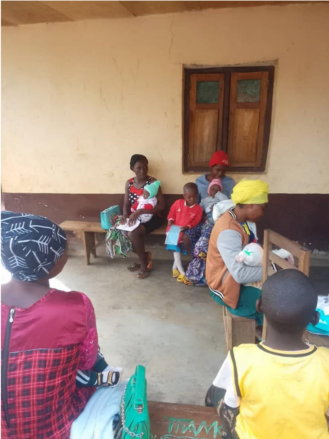
Mothers and their children waiting for our RECEADIT Medical Team to start their vaccination at our RECEADIT/GlobalGiving Partnership, Ngemsibo Community Health Center.