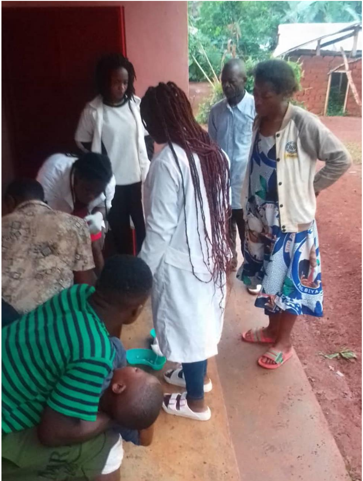
Our Determined and Committed Female nurses of our RECEADIT-Partnership Community Health Clinic at Bassamba Vaccinating children.