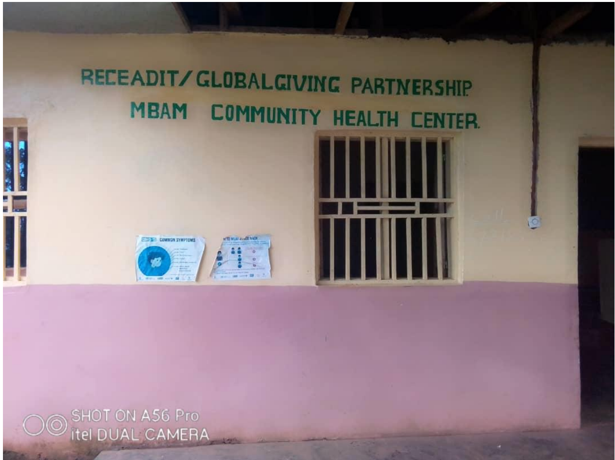
RECEADIT/GlobalGiving Partnership, Mbam Community Health Center