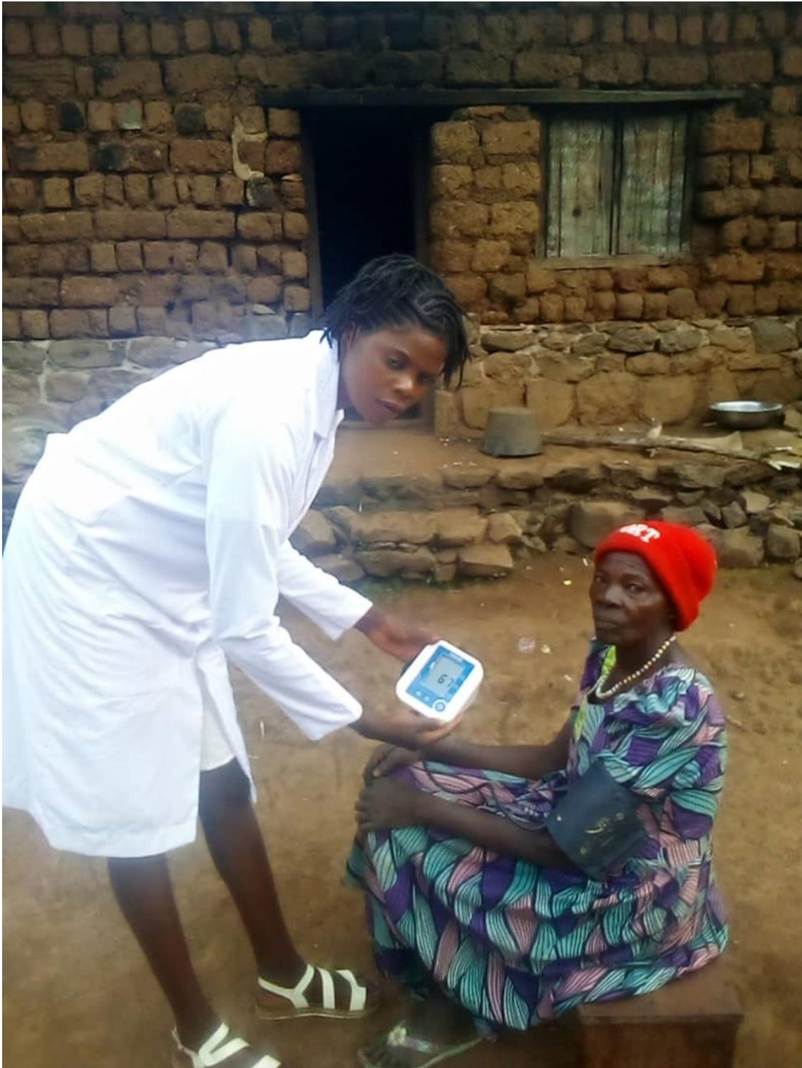
Our RECEADIT Medical Team Member of RECEADIT/GlobalGiving Partnership Community Health Center at Muteff, on her Home Visits Program, attending to a Community member at her home in the Muteff Community.