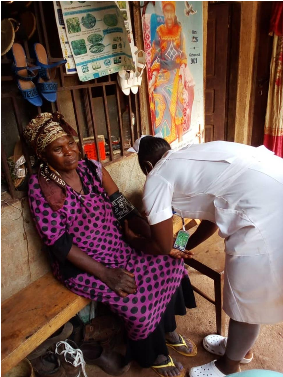
Our RECEADIT Medical Team Member of RECEADIT/GlobalGiving Partnership Community Health Center at Kitchu, attending to a female patient at her home during her Home Visits Program within the Kitchu Community.