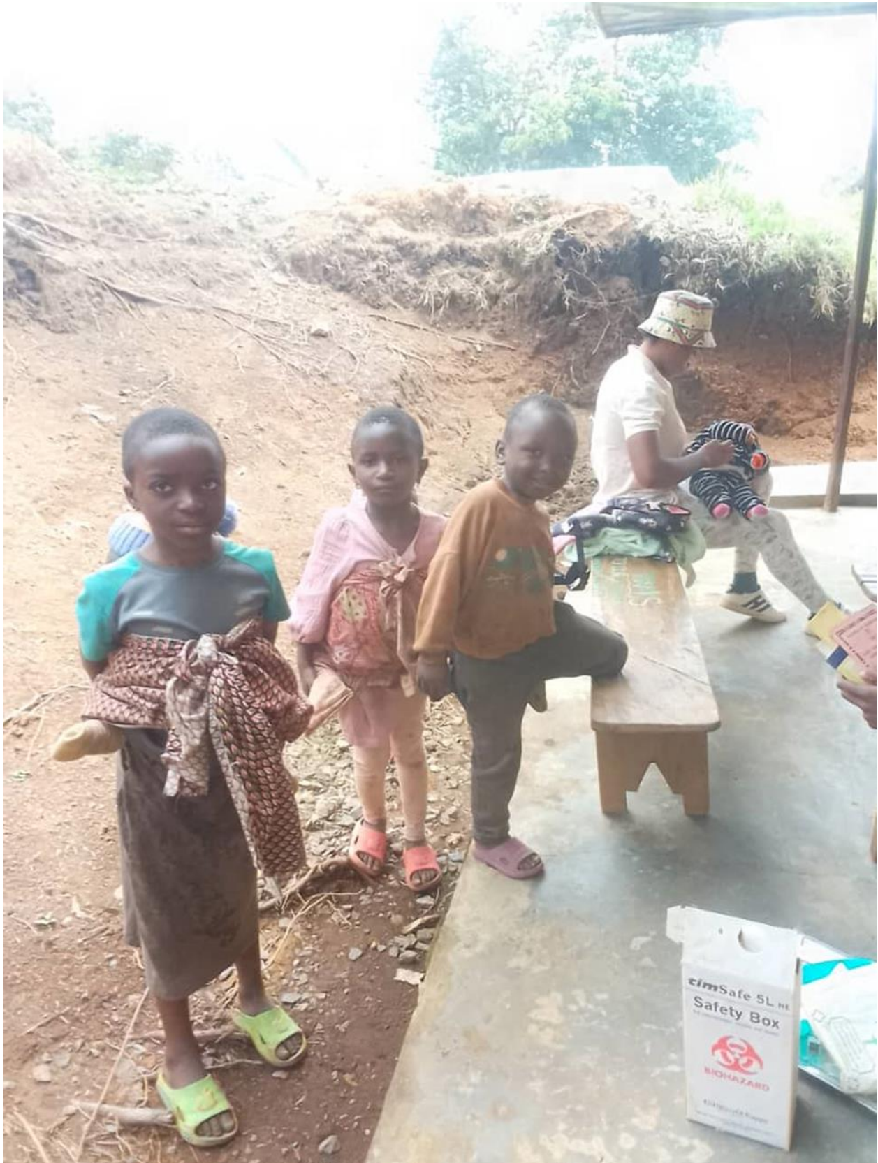
A Mother waiting for our RECEADIT Medical Team to vaccinate her five children at our RECEADIT/GlobalGiving Partnership, Ngemsibo Community Health Center.