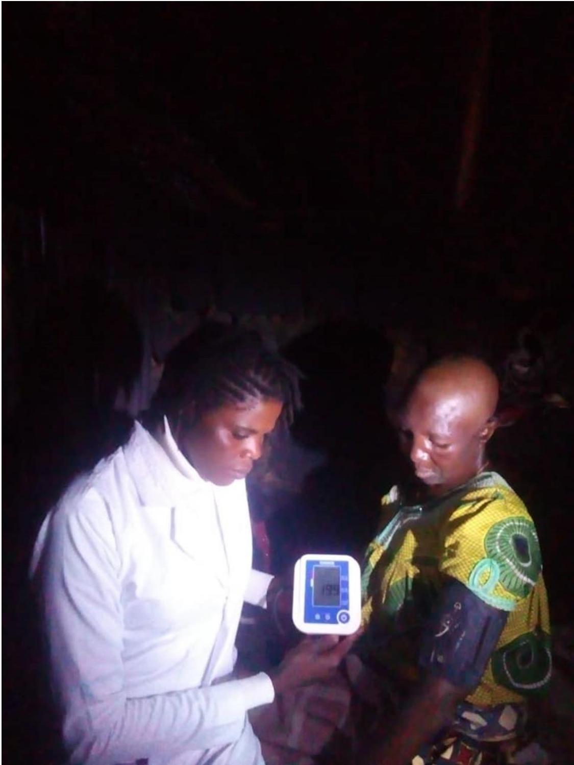
Our RECEADIT Medical Team Member of RECEADIT/GlobalGiving Partnership Community Health Center at Muteff, on her Home Visits Program, attending to a Community member at her home in the Muteff Community.