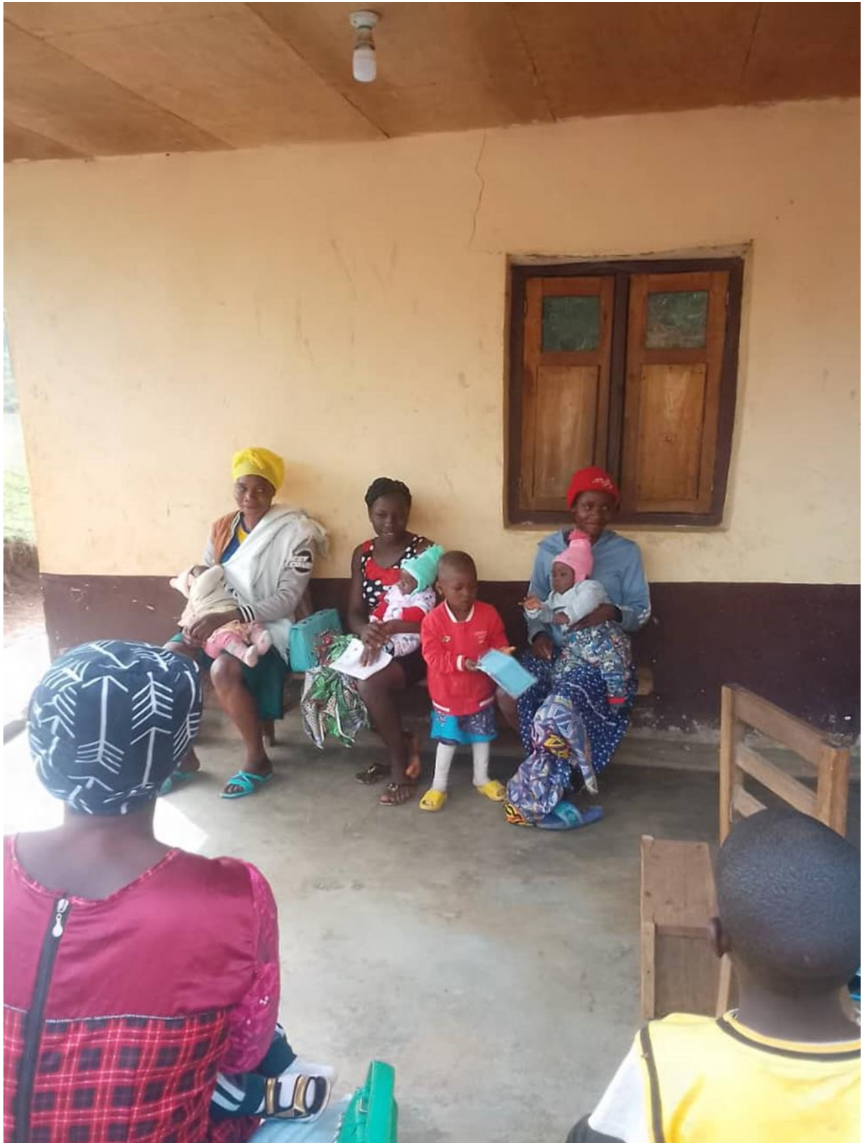
Mothers and their children waiting for our RECEADIT Medical Team to start their vaccination at our RECEADIT/GlobalGiving Partnership, Ngemsibo Community Health Center.