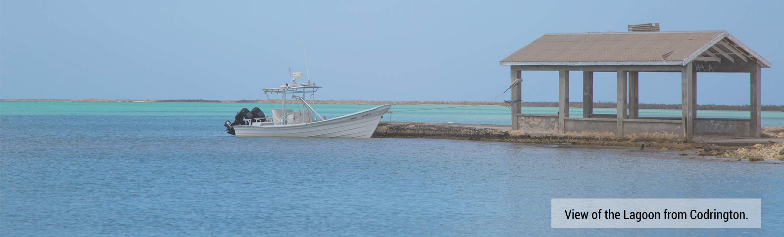
View of the Lagoon from Codrington.