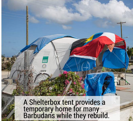
A Shelterbox tent provides a temporary home for many Barbudans while they rebuild.

Barbuda continues to be severely damaged from Hurricane Irma. An estimated 500 persons have returned to Barbuda out of 1,600 (2011 census), but the majority of homes and businesses are still without running water or power. People are utilizing Shelterboxes if their home was destroyed, and many intact homes still have tarps covering the roof. The people continue to work diligently to restore their homes and start anew.