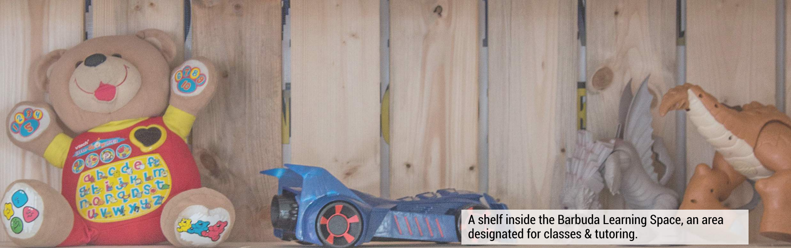
A shelf inside the Barbuda Learning Space, an area designated for classes & tutoring.