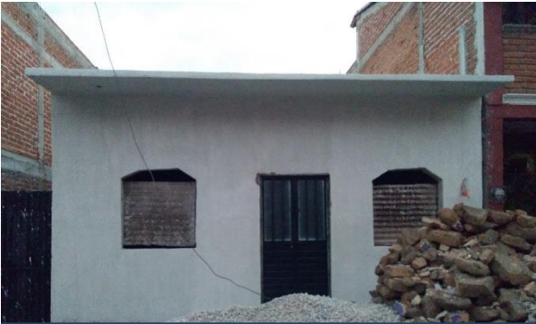
Mercedes Salinas Trujillo

Cintalapa de Figueroa Cintalapa, Chiapas