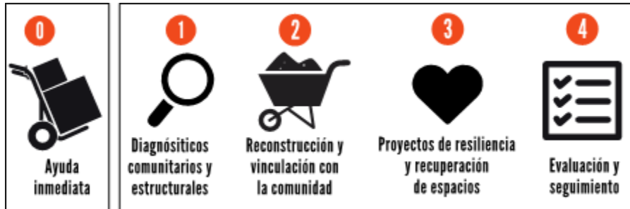
Squeme 1. Intervention Stage

The project is designed to assist communities affected by natural disasters through five stages of intervention