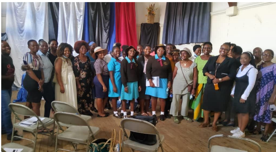
One of the activities with the support group