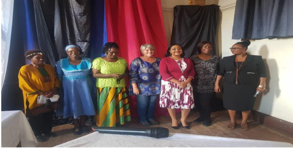
The Support Group