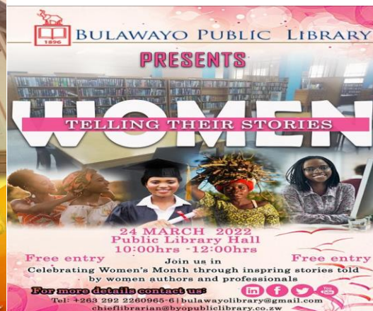
Posters used to invite women and girls to the Library