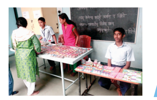
Year Estd. 2001 No. of Students 76

Ashadeep Special School, Balaji Nagar, Sangli.