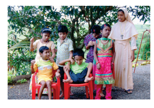
Year Estd. 1994 No. of Students 08

Shanti Nivas Care Home for the Profoundly Disabled Children, Khutalwadi, Shahuwadi, Kolhapur.