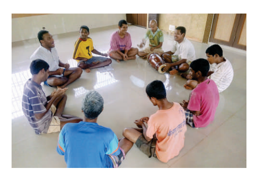
Year Estd. 2003 No. of Special Adults 26

CHERISH Vocational Training & Rehabilitation Center for the Intellectually Disabled (adult male persons), Nirmalgiri, Amberi, Kudal, Sindhudurg. 6