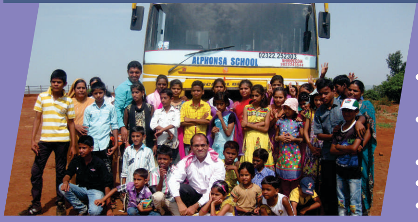
2. Dilasa Counseling & Support Centre Kolhapur