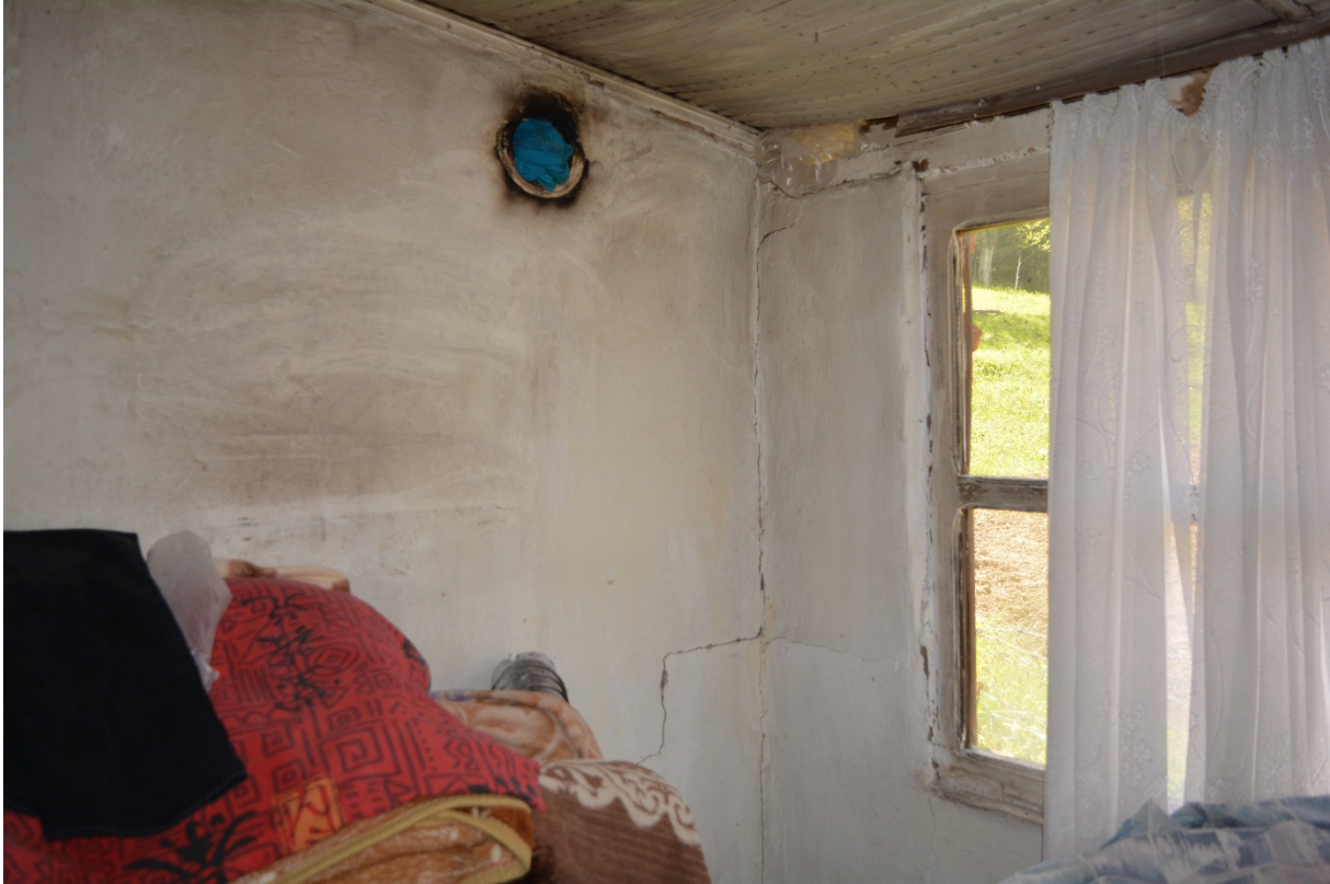
Inside of the house-one room