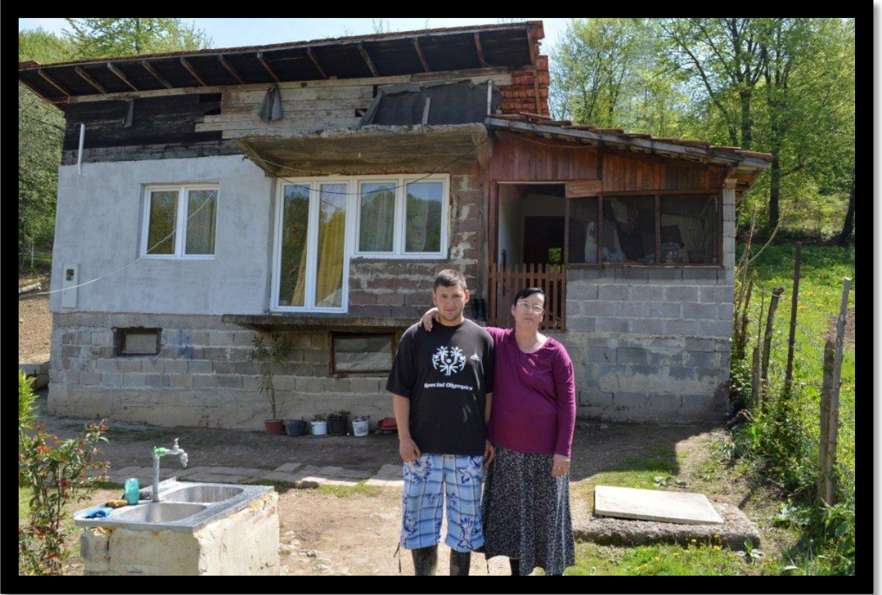
Construction of a house for poor family from Živinice, Bosnia and Herzegovina