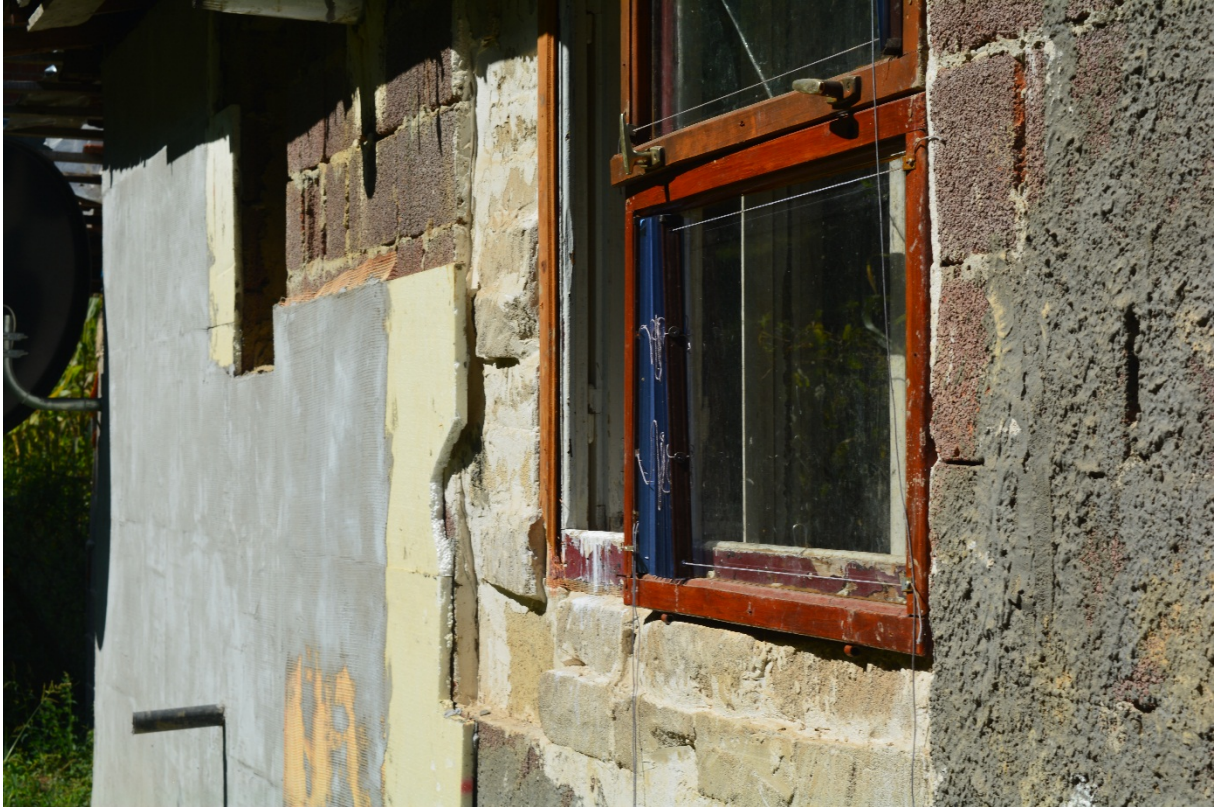
The house is not isolated, the windows and doors are all collected from the garbage waste and set just for first hand.