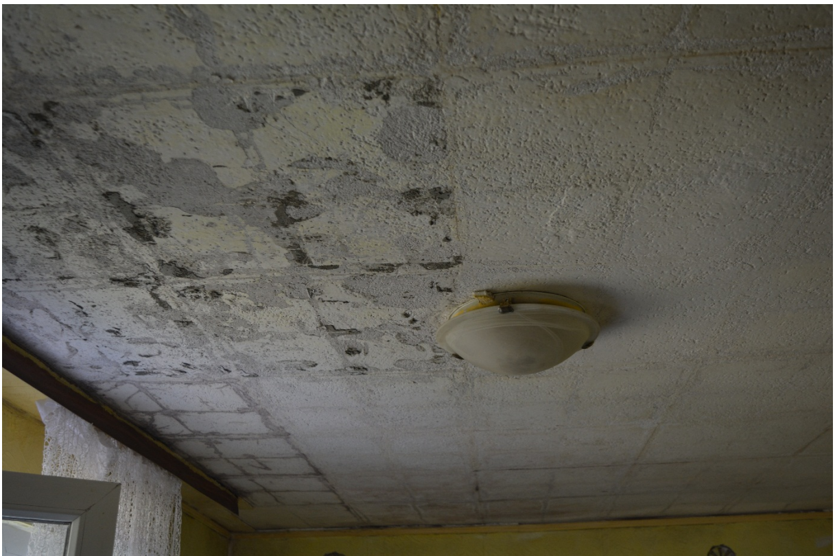
Stains from water and snow that leaks into the house