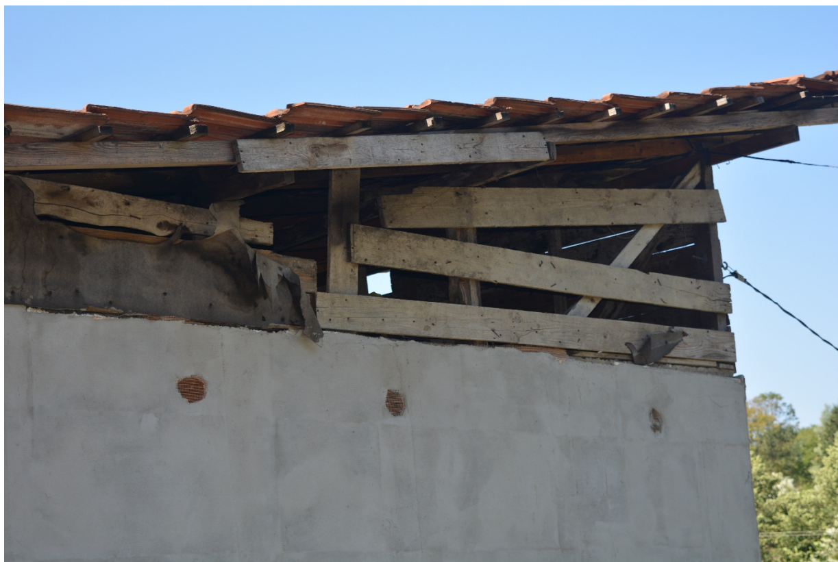
The roof is leaking, it is not done properly. During winter there is danger of broking snow into house.