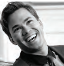
ANDREW RANNELLS 1997 Theater