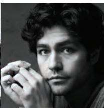
ADRIAN GRENIER 1994 Theater