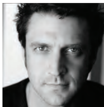
RAÚL ESPARZA 1988 Theater