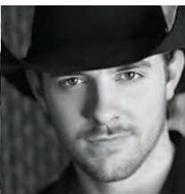
CHRIS YOUNG 2003 Voice