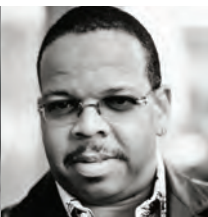
TERENCE BLANCHARD 1981 Music