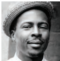
ROY HARGROVE 1988 Jazz