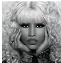
NICKI MINAJ 2000 Theater