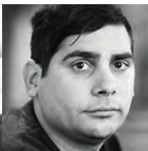
HERNAN BAS 1996 Photography