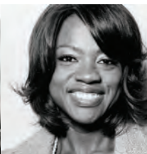
VIOLA DAVIS 1983 Theater