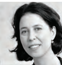
ALLEGRA GOODMAN 1985 Writing