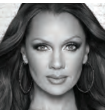
VANESSA WILLIAMS 1981 Theater