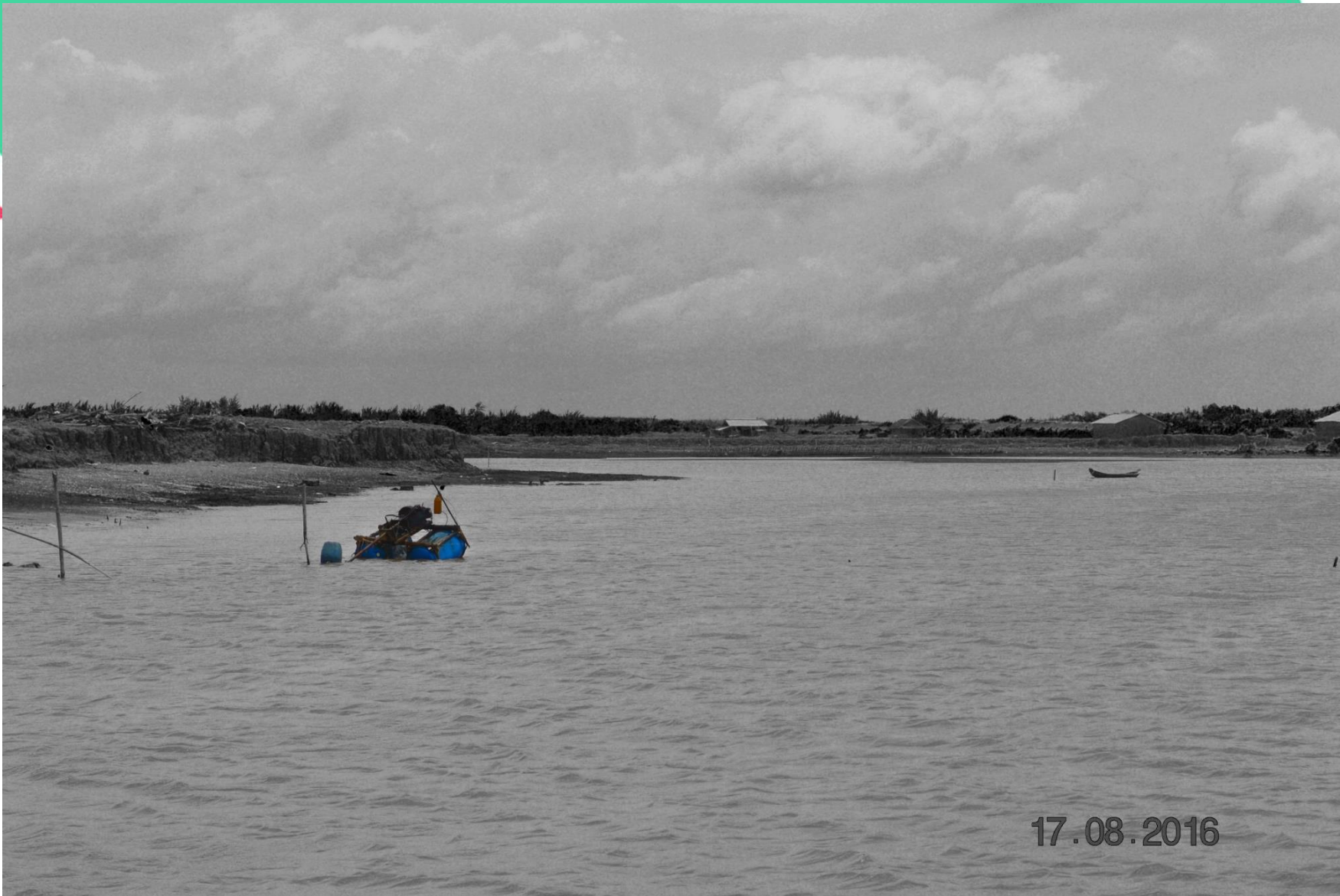
Land lost in clams raising area. (Ben Tre)