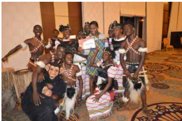
The award winning team, Rockies Troupe posing with the award; 29 March 2018