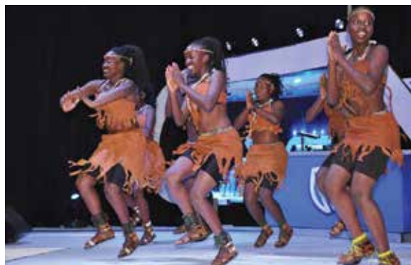
Rockies Troupe performs at the Stanbic Bank National Schools championship held at Hotel Africana