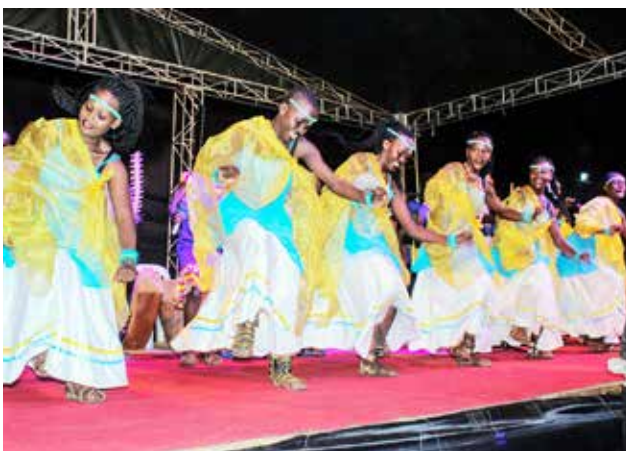
Performing Kitagururo dance at the concert