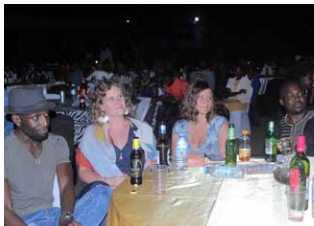
Revellers at Rockies Make Them Smile Annual Chairity Concert