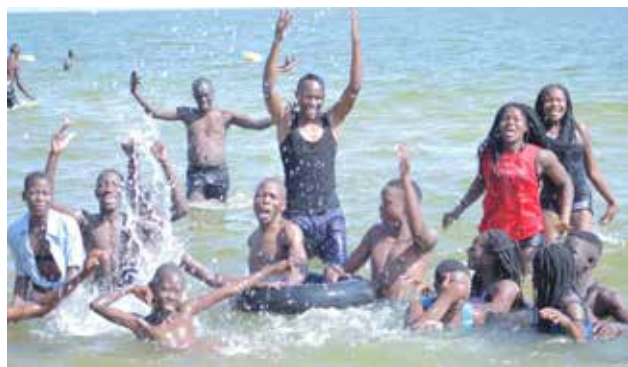
Rockies family end of year fun celebrations at Speenar beach