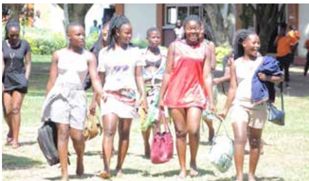
The beautiful talented and energetic girls of Rockies troupe having a light moment on shores of Lake Victoria