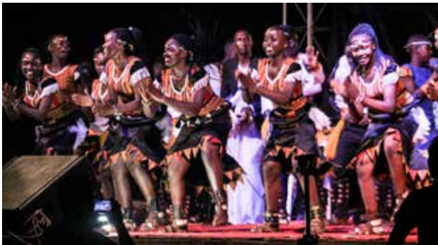
Perfomance at the concert held on 30th November 2018 at Pope Paul Memorial Hotel

The Make Them Smile is a signature calendar showcase event for the organization. On this day we come out to do a number of activities from thanking our clients for the whole year's support (promoting us and as well giving us business), Dance acts, Fashion show, Drama and Fundraising for any need that the organization feels needs support from various stakeholders for the good of the whole public. This year makes it 3 years ever since we began this activity. And we would like to take this same opportunity to thank our partners ( Segal Family Foundation, National Water and Sewerage Corporation, The Microfinance Support Center, Pope Paul Memorial Hotel and the Catholic parishes of Mutundwe, Nsambya, Kansanga and Ntinda ), our family of clients, the Rockies family and the general public that has worked hard into ensuring we fundraise for the purchase of Land which is going to host the Academy. 2019 will be the year when we officially lay a foundation stone for the construction of the Academy.