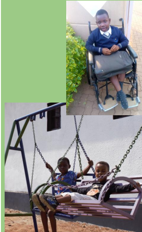
Gikondo Centre: New fences, toilets and classrooms have been built

CMO already has one successful ECD centre in Ndera and is currently refurbishing the Gikondo Centre, previously used for accommodating victims of GBV, to provide a second ECD. Now the girls have been safely rehabilitated and reintegrated back into their families or rented accommodation, their children can benefit from a safe, nurturing, educational environment, while they look for work. The new ECD will bring our total of places up to 100. That's 100 3-6yr olds receiving two nutritious meals per day and their families benefitting from parenting workshops and other support such as monthly food and hygiene packages.