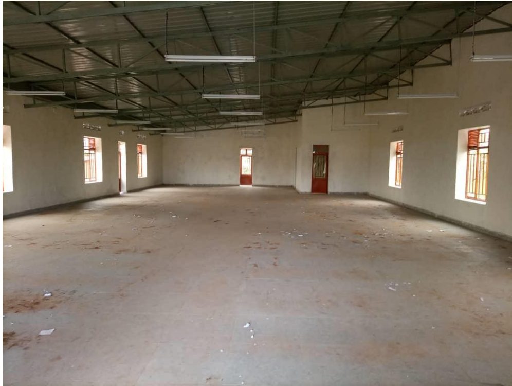
Inside of the Kirehe Girls' Empowerment Centre when construction phase 1 was completed.