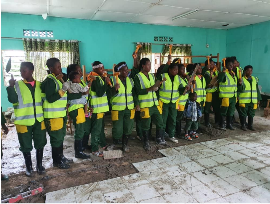
Construction, tiling, and paving: The group put their skills into practice while applying tiles to cover building's floor.