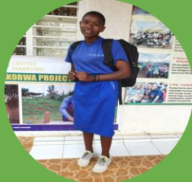
Education & Early Child Development