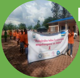
Justice & Advocacy