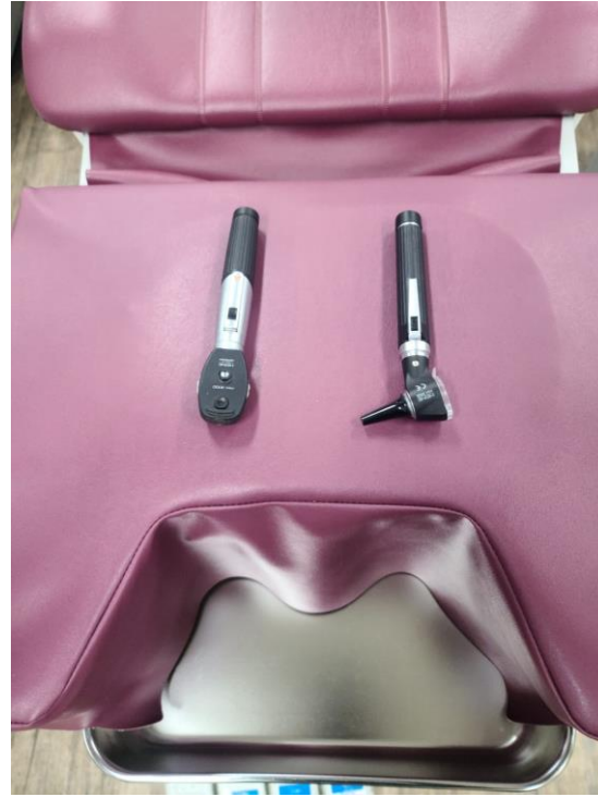
More examples of other medical equipment and tools available inside the mobile clinic.