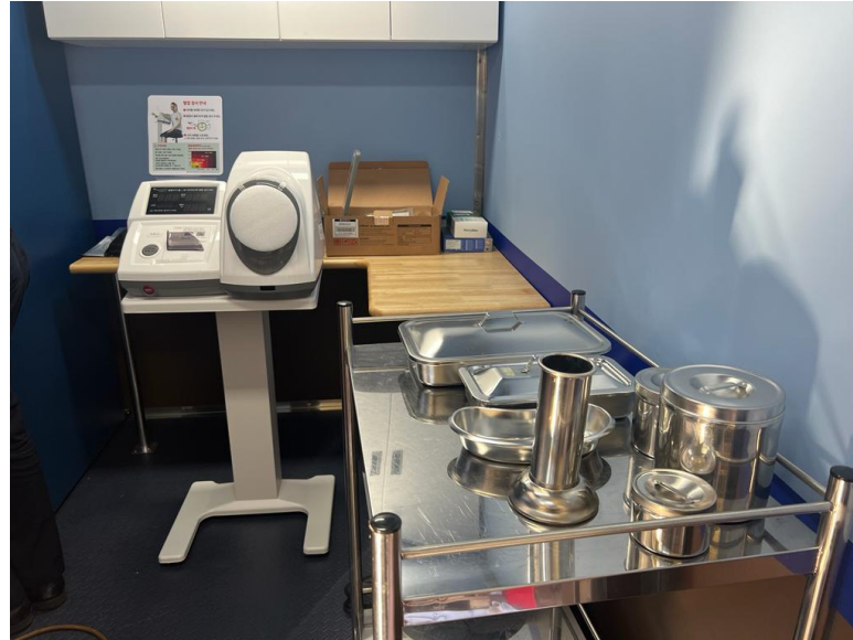
An example of medical equipment inside the mobile clinic.