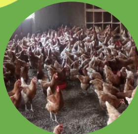
Socio Economic & Development

Centre Marembo's 5 program holistic approach provides a flexible and adaptable route for each girl that is referred to us by local authorities, or who approaches us directly.