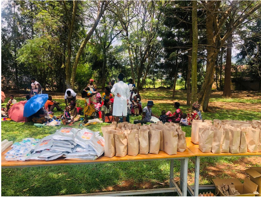
Weekly Activity: distribution of food packages and other essential items.