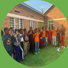
Rehabilitation & Reintegration