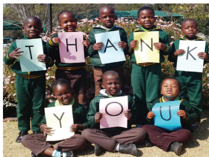
Learners at Nokuphila School, Tembisa

- Parent, Highlands Primary School, Mitchells Plain