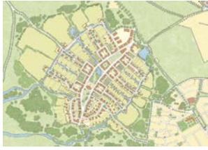
Example: Southlands, Canada

added to the overall size of the project. However, some of the plantation sites could be built along the boundary, which could reduce the number of boundary cottages.