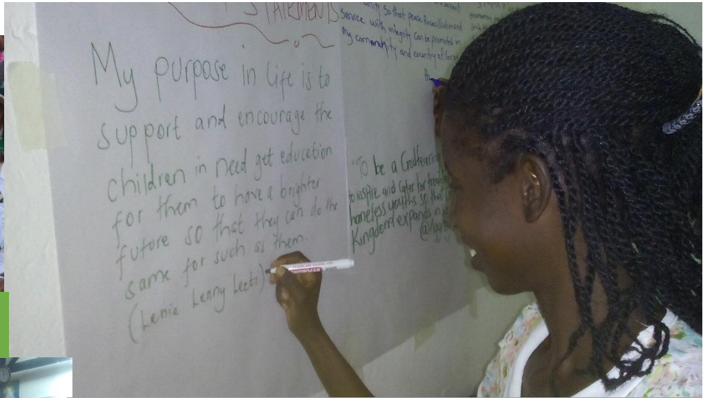
Cornerstone Development Vacists – JumpStart Program