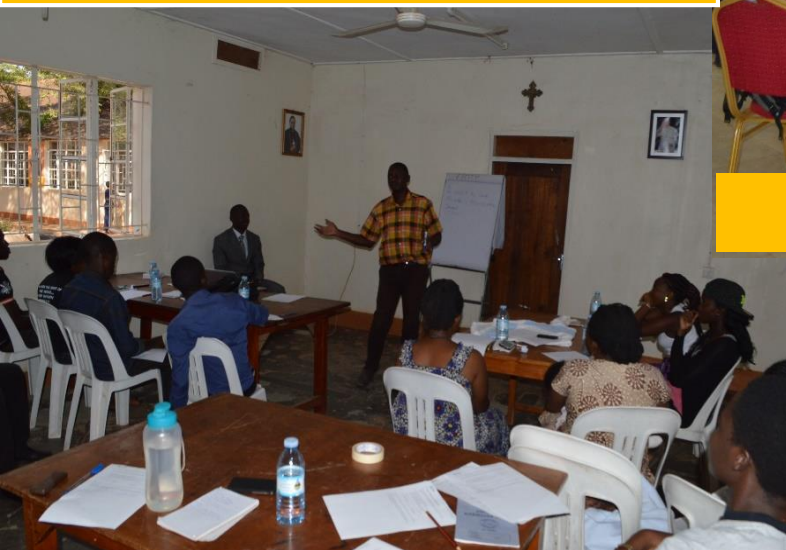
Arise 2017- Goal Setting