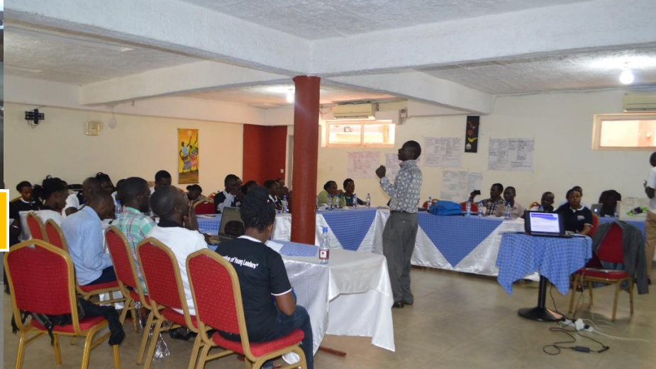
Restless Development Interns – Financial literacy