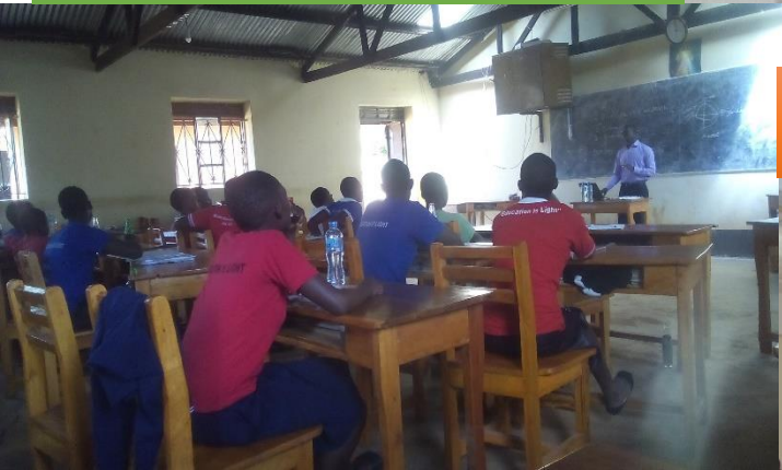
Kyenjojo – Behavior change and Leadership