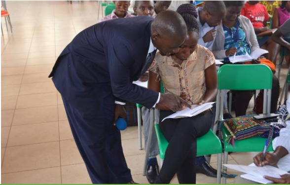
NET Ministries Alumni – Branding & Business management skills