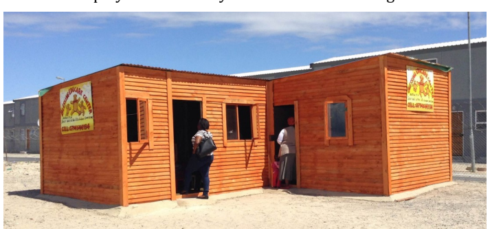
One of the structures purchased with emergency grant funds

members continue to work with Blessings' leadership to improve financial bookkeeping and community engagement. Specifically, Blessings has planned parent meetings to move toward electing a committee made up of community members to assist in governing the preschool. CHOSA staff are also planning to implement leadership training with the preschool's founder so that she can more effectively manage her teachers and staff. We are proud to have been a part of bring greater stability to the lives of the children Blessings serves.