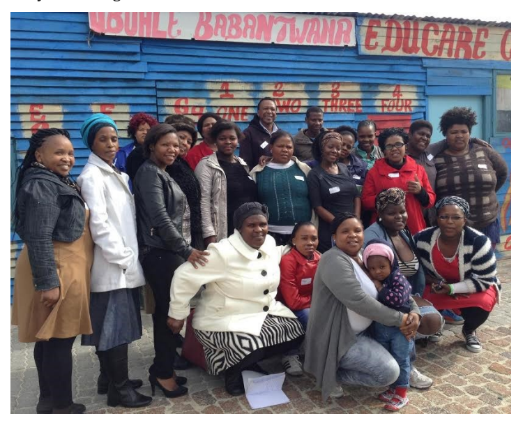
Attendees pose outside of Ubuhle Babantwana, where the event was hosted

through these quarterly events that they offered to serve as host of the next one!