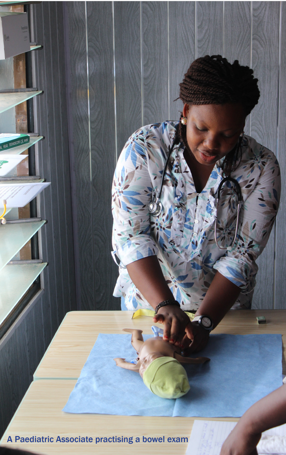
A Paediatric Associate practising a bowel exam

BUILDING CAPACITY in the next generation of health-care providers