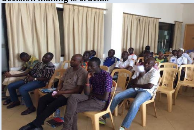
A cross-section of youth at the launch

This then makes 2016 the most appropriate period for the youth to draw the attention of government and its agencies on the policy gaps in addressing youth challenges, while encouraging the youth to take advantage of the season to advocate for youth centered policies from politicians. The issue of youth participation in decision making is crucial.