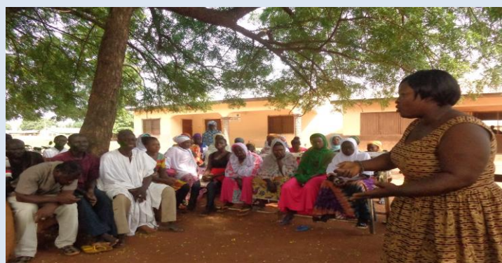
A teacher addressing issues raised by Parents

The results of the CLA were disseminated in 20 communities in the STK and 17 communities in the Sagnarigu district. The dissemination took place at the public primary schools within the EA in the community. The meetings were between parent and teachers as well as PTA/SMC members in the community.