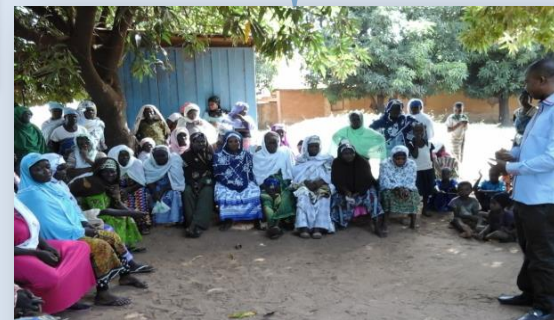
Vice president of the league of youth interacting with alleged witches