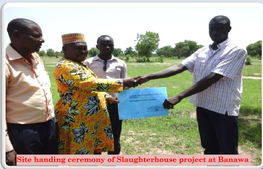
Site handing ceremony of Slaughterhouse project at Banawa