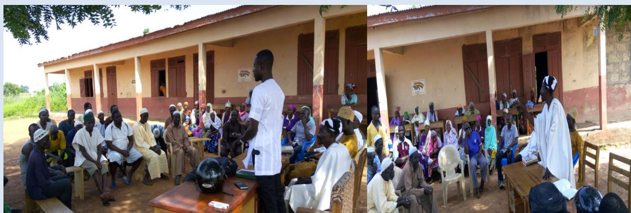
A staff of CALID sharing findings of assessment to Parents and Teachers at Kasalgu community in Sagnarigu District.

through assessment of numeracy and literacy competencies