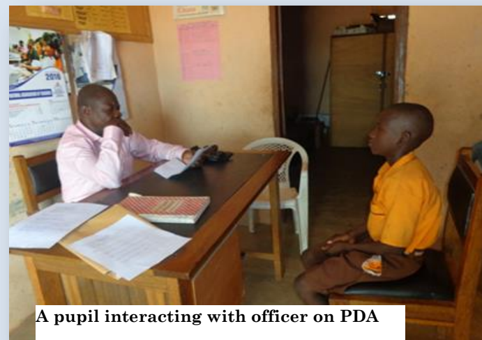
A pupil interacting with officer on PDA

A forum On School Performance Appraisal Meetings was held by CALID which engaged Directors of Education, Unit Managers, Teachers, Sagnarigu and Tamale Parent-Teacher Associations Network (STAMPATA), Circuit Supervisors and Community Partnership Coordinators and enabled stakeholders to assess the contribution of SPAM in the performance of education in the region. Stakeholders together looked at the achievements and challenges faced by education actors in organizing SPAM at schools and districts levels. After which action plans were drawn committing stakeholders to the process. The main objective of the engagement was to re-introduce and support the regularization of SPAM in schools.