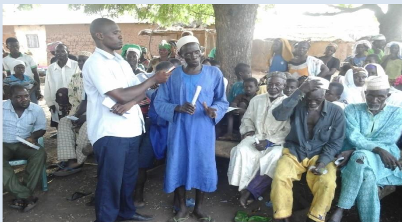
A community member seeking for clarity on payment for replacement of lost ID Cards

Another critical issue that runs through the various community registration centers was the issue of minors. The claim was that as a result of stunted growth and development of many children, there were children who are 18 years and above but physically they look very smallish. This brought about confusion in some of the communities.