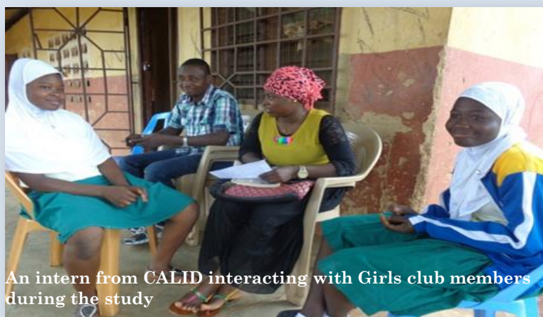
An intern from CALID interacting with Girls club members during the study