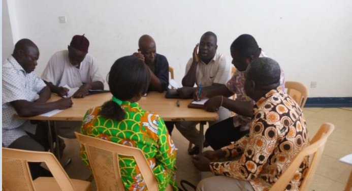
Educational stakeholders engaged in a group session during SPAM Assessment forum

CALID' activities were geared towards promoting rights in schools: These activities are in fulfillment of Action Aid' key result area of promoting quality public education for girls and boys which respects their rights in school and in communities. In the second and third quarters of the year, CALID worked on promoting of girls' education feeding into ActionAid's Regional Priority of having an "enhanced school governance system at both local and District levels while advocating for children's