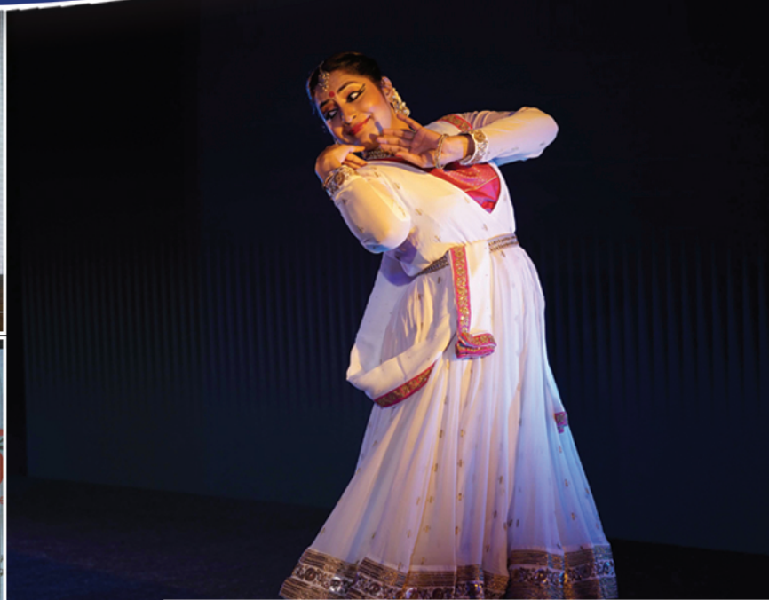
We celebrated our Silver Jubilee at Taj, Bangalore on November 3rd 2019.