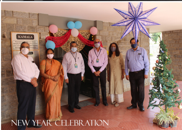
NEW YEAR CELEBRATION