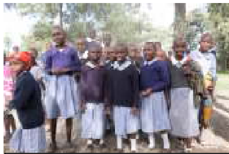
Primary school girls in their uniforms on the first day of school

We serve many children and would enjoy telling you about all of them but the book would be quite large.