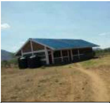
Gordon Clem Academy

A much needed school has been beleaguered with challenges. As Expanding Opportunities did not have enough funding to operate the school, and the families could not pay the necessary school fees, Gordon Clem Academy was facing closure. The head teacher offered to operate the school at no cost and we gave permission.