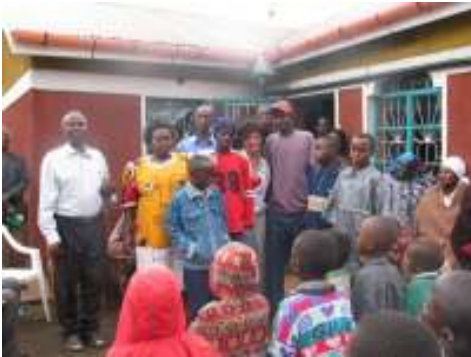
2004....FLASH BACK: The first 8 boys and the first caregivers.

Each child the magistrate selected gave us another opportunity to check up on the children we have served. Some only briefly, some most of their childhood. Our children have grown to be farmers, street vendors, a member of Kenya's Special Forces, automotive body and electrical, continuing students, and even our first 4 year college graduate having attended on a full scholarship.