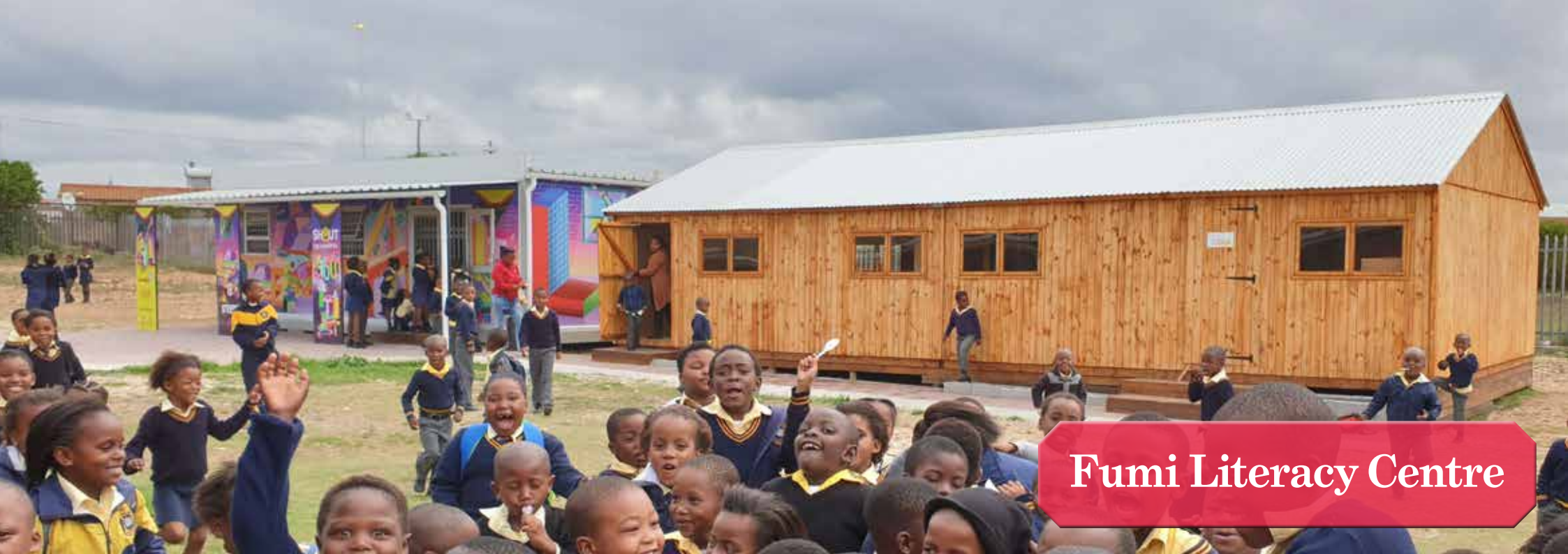
Fumi Literacy Centre