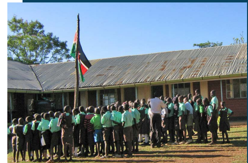
Morning assembly & flag raising - the kids are ready to learn