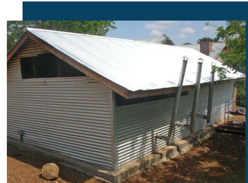
Hope Center's new kitchen - improved ventilation & safety