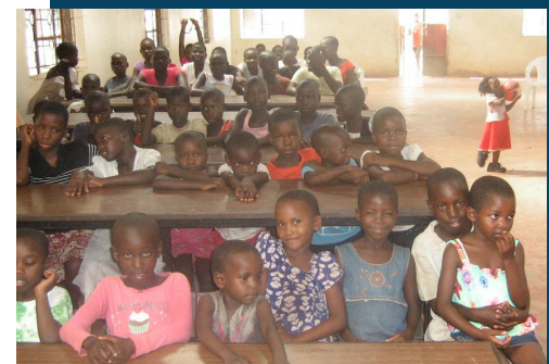
Eager & energetic - the children gather in the dining room