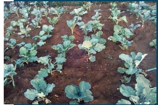
Kale plants ready to be transplanted