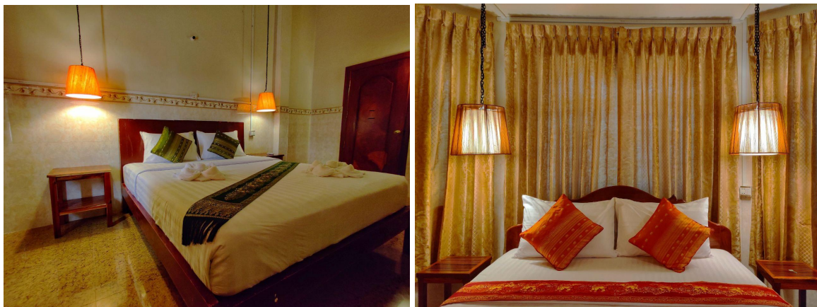
Guestroom ready for trainee to practice

Recently, our guest rooms have been put into sale for the first time after Covid-19 and will be used for our trainees to practice their skill after class.