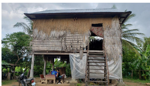
Phiya, one of our trainer was interviewing the youth in the village