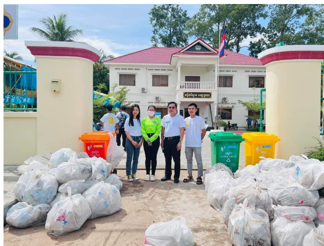
Le Tonle Team joined the environmental cleaning day in Kratie Town

At the same time, Le Tonle attended an environmental cleaning day in the town of Kratie to raise awareness of the public in waste management.