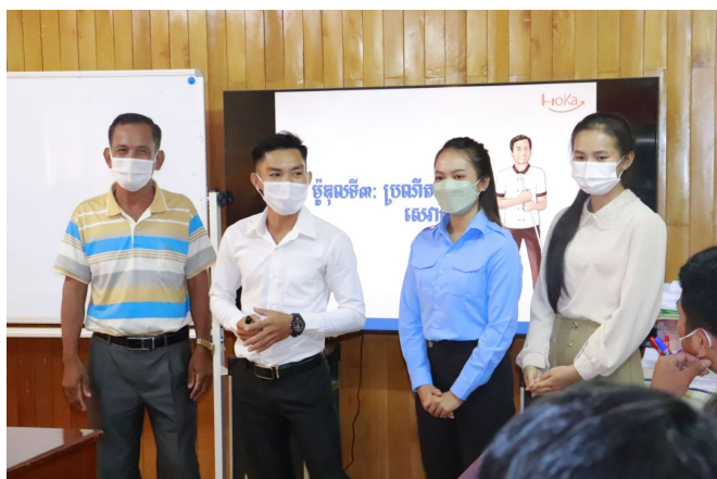
Chimmor was conducting inhouse training program