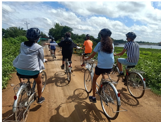
2nd tour group visit the village