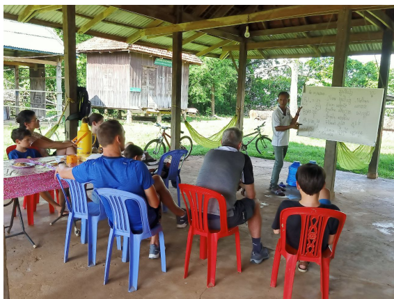
1st tour group visit the village

Le Tonle is reopening in October 2022. This is a definite plan set out by the management team. We have currently identified a new location for re-starting and preparing a contract (the old building was taken back by the owner). Our next step is moving the materials into a new building. Again, one of our trainers successfully conducted an inhouse training for a group of tourism employees from businesses in Kratie Town under the program of HOKA.