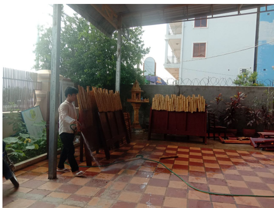
Sokhy was cleaning Le Tonle materials prepare for moving out