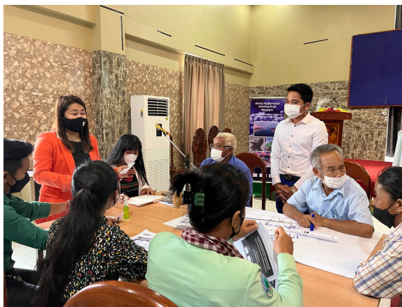
Solid waste management training workshop