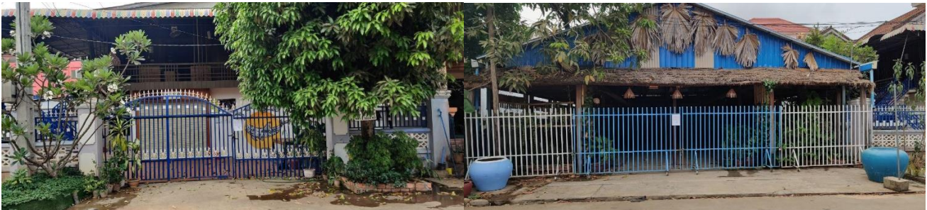
Our center during the closing time

To fight through this the standby team had taken several activities in the past 3 months. For instance, submitted around 6 proposals to emergency small grants but only 2 were accepted equal to 3k, re-opening its guesthouse and café and cut off many team members include trainers.