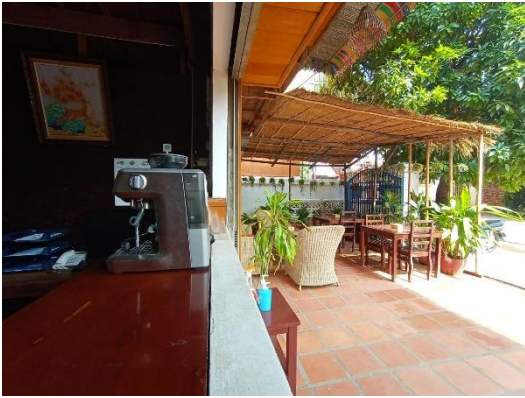
Le Tonle Café Re-Opening