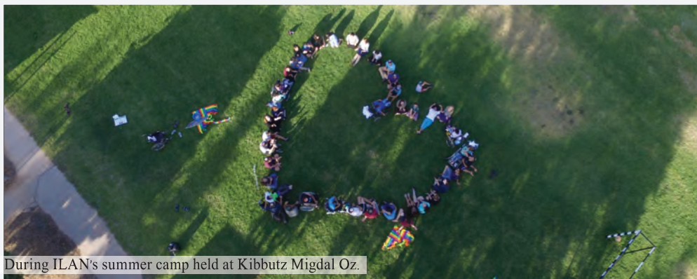
During ILAN's summer camp held at Kibbutz Migdal Oz.

We continue to be attentive to the unique needs of people with physical disabilities and are working to develop suitable services in cooperation with institutional, governmental, and public bodies in Israel and abroad who share ILAN's vision and path.