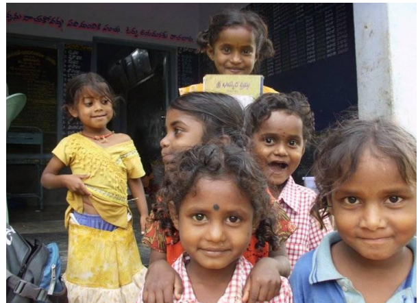
The children at the Child-Care Center at Pulimadugu village in Chittoor district

These centres function as pre-schools with a strength of around 25 children each between the age group of 2-5 where they get fundamental primary education, lessons on health & hygiene, and nutritious meal. These centres are also equipped with toys and learning materials for the exclusive use of the children. After this pre-schooling they would join the regular schools for further education. SCAN tries to offer these underprivileged children a childhood that will have a positive impact on their later lives equipped with good values.