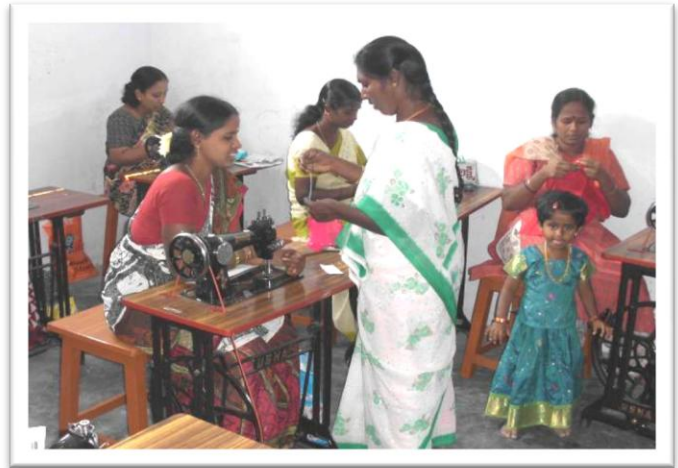
Students learning computers and tailoring skills at the JIVT vocational training centre