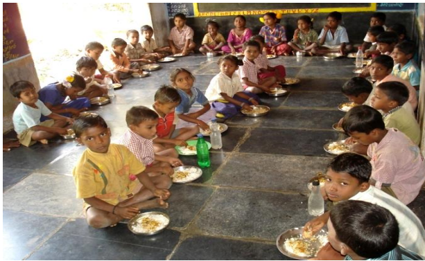
Children at our Child care centres