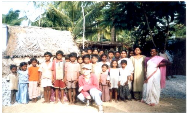
An international volunteer with the children