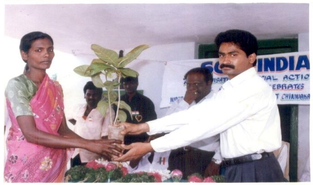
Distribution of saplings to the women group members