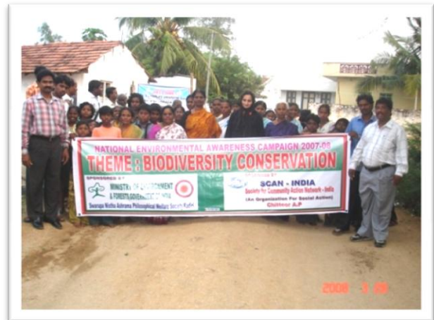
The Chittoor town Municipal commissioner inaugurates the tree plantation programme

"We don't inherit the earth from our ancestors; we borrow it from our children"