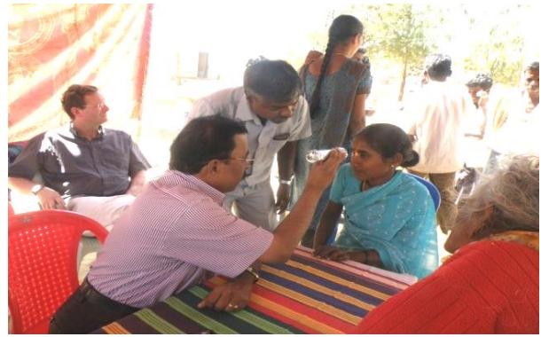
Health checkup Camps conducted by SCAN-INDIA in the villages in Chittoor district