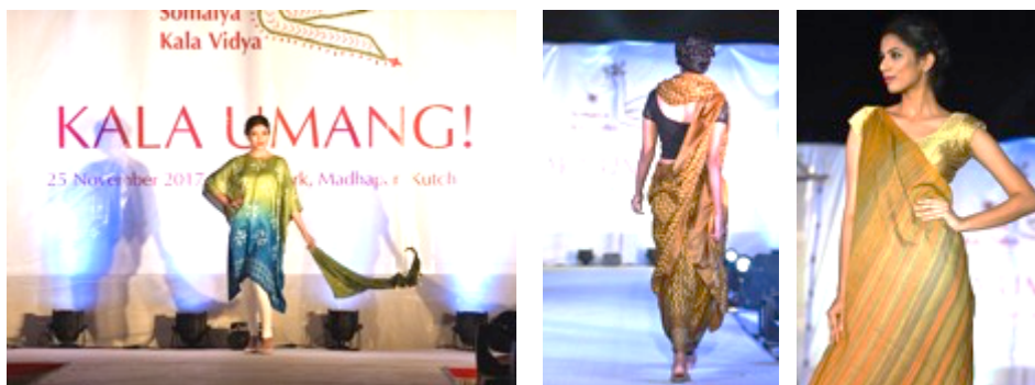
Creatively draped and simply stitched garments exemplified sustainable craft-based fashion. Mr. Bissell was impressed with where craft had reached under SKV direction!