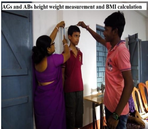
AGs and ABs height weight measurement and BMI calculation