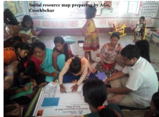
Social resource map preparing by AGs, Cooch Behar

Adolescents are participating in Gram Sabhas (village meeting to discuss government and local development) and submitting their plan, Murshidabad