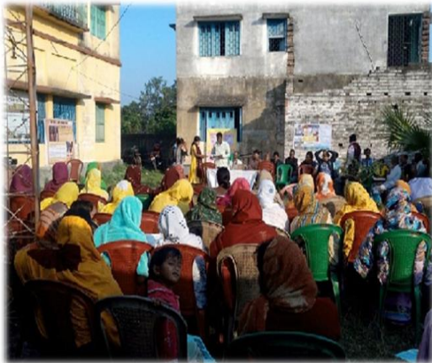
Adolescents are participating in Gram Sabhas and submitting their plan. Murshidabad

Adolescents are participating in Gram Sabhas (village meeting to discuss government and local development) and submitting their plan, Murshidabad