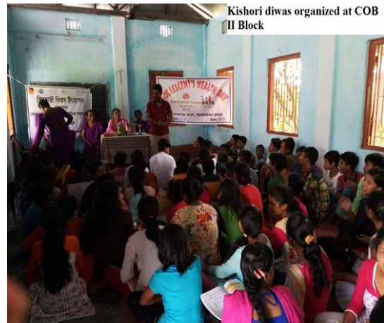
Kishori Diwas (general health check-up of all adolescent girls) organized at COB II Block