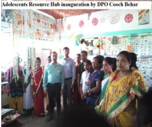
Adolescents Resource Hub inauguration by DPO Cooch Behar