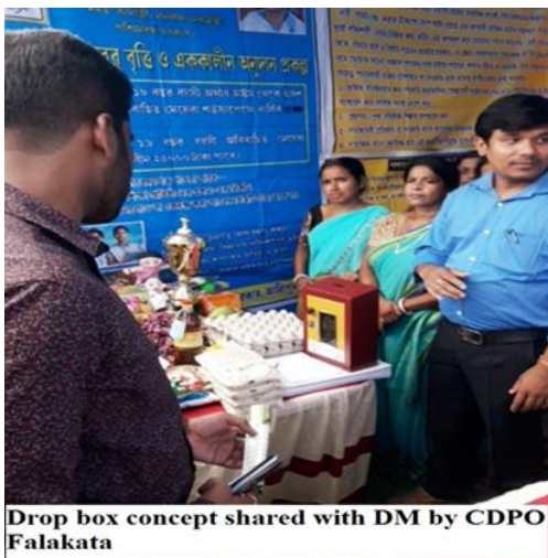
Drop box concept shared with DM by CDPO Falakata

Drop box concept for anonymous complaints and requests for help shared with DM by CDPO Falakata