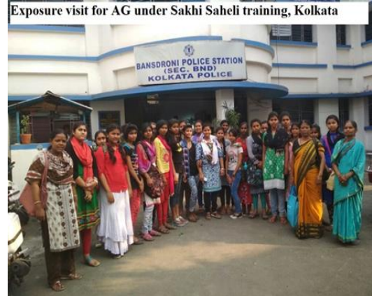
Exposure visit for AG under Sakhi Saheli (adolescents' peer leaders) training, Kolkata