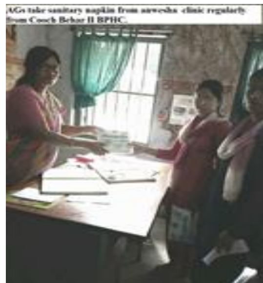
AGs take sanitary napkin from Anwasha clinic regularly from Cooch Behar II BPHC.

Drop box concept for anonymous complaints and requests for help shared with DM by CDPO Falakata