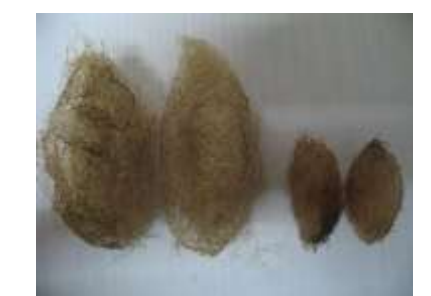
Cocoons (Left: Ceranchia) (Right: Suraka)

This new species of moth is also native to NE Madagascar and feeds on a large host tree that grows in and around the forested areas. The species name of this tree has yet to be identified, but the SEPALI team has planted its seeds in a nursery to become familiar with the plant. SEPALI is particularly excited about experimenting with this species of moth because it can be used to produce a spun textile and it will add versatility to the SEPALI product line. SEPALI will begin to experiment with ceranchia in Ambinanitelo and Marovovonana.