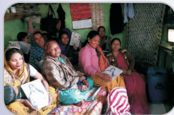
Women learning with the help of Computer Based Functional Literacy Programme