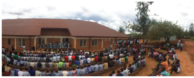
Collaboration Grows Community