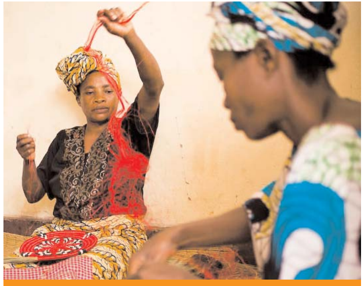
CHF is helping to strengthen economic options for Rwandans affected by HIV/AIDS