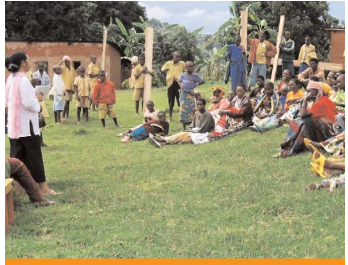
CHAMP's OVC Advisor works with a community served by Rwandan Partner Organization Icyuzuzo.

epidemic and to support their communities. At the same time, CHF is providing its partners with extensive skills-building assistance that is strengthening their capacity to mobilize communities, to manage volunteers, to administer programs and to grow institutionally. As part of its strategy to increase the role of Rwandan NGOs, CHAMP is working to transfer beneficiaries currently being served by international organizations to local Rwandan partners.