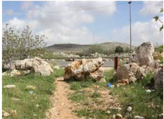
Above: dirt road out of the village which has been blocked by the IDF. Metalled roads are also regularly blocked by boulders, checkpoints etc.

The film gives a voice to real people who are left invisible by the media, and provides the visitor with meticulous data about the effects of the occupation on Burqah. . . . showing how the settlements and their interests play a central role in Israel's planning, even at the cost of grave harm to Palestinian residents . . . how a legal-administrative web stifles a village . . '