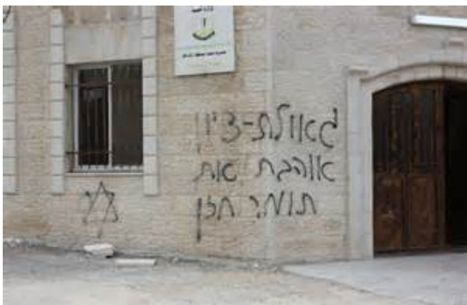
Left: graffiti left by settlers on a village mosque.