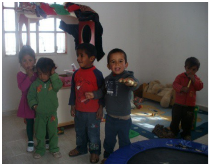
The Umm El Khair kindergarten supported by the Villages Group

The Villages Group is clear about the inherent disparity in power between itself and the villagers, and about its determination to build partnerships, working with rather than doing good to the villagers.