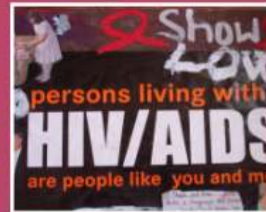
Egbe Vera Chimabi,1