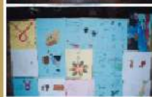
PT Actwid pix[1]

Community Village Abuja for the 14th International Conference on AIDS and STIs In Africa (ICASA) 2005.