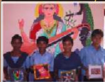
PT Indian Artists

WORKSHOP/EXHIBITION OF WORKS BY YOUTHS FROM AROUND THE WORLD.