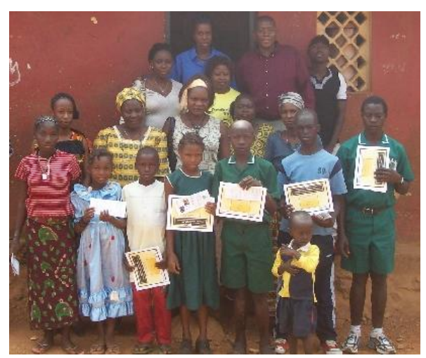
Scholarship Recipients at Award Ceremony